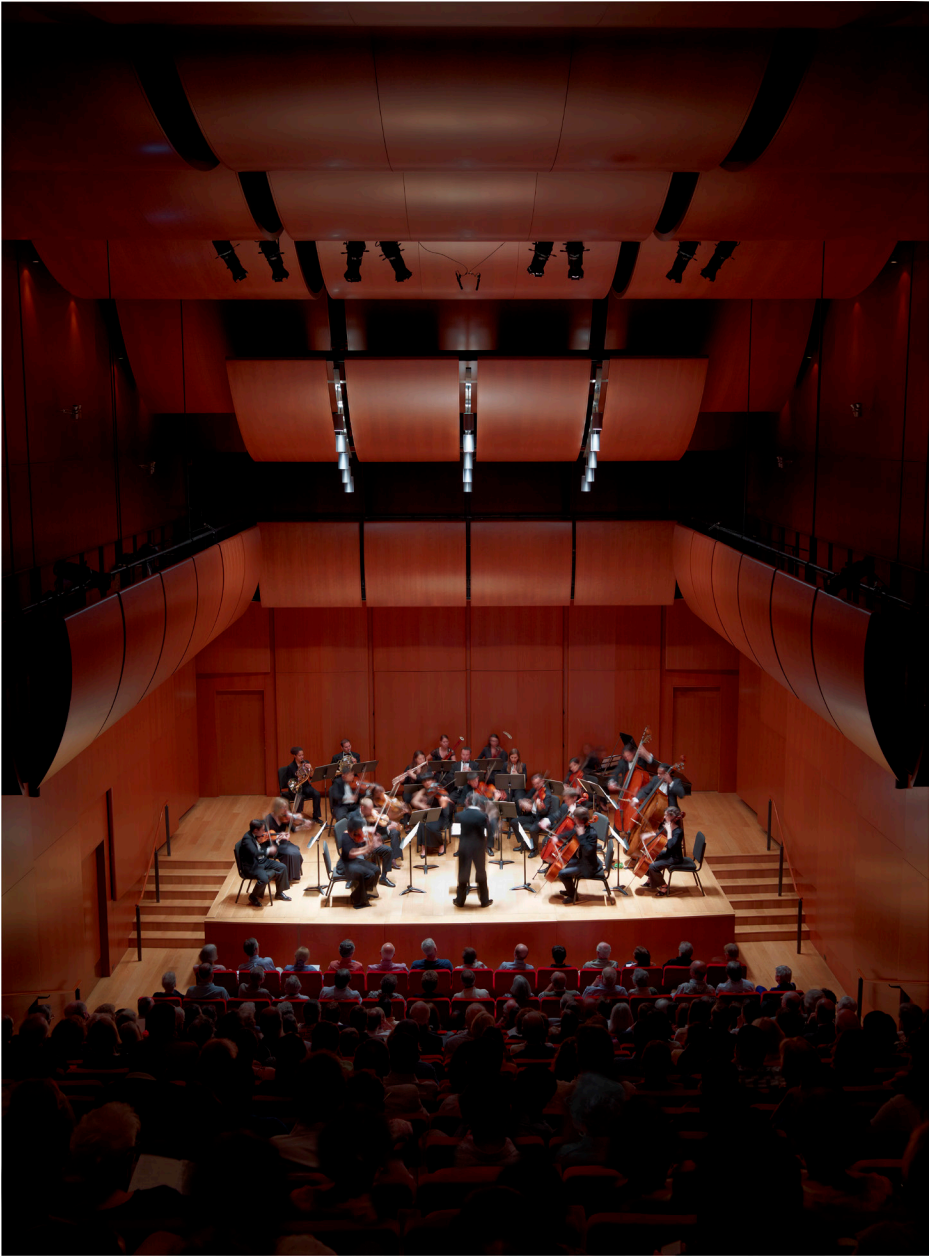
Gilder Lehrman Hall during a music performance.

MARCH 28 The 2024 Kenneth A. Lohf Poetry Reading Claudia Rankine