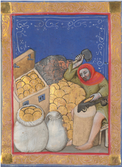
Register of Creditors of a Bolognese Lending Society , Italy, Bologna, ca. 1390–1400. The Morgan Library & Museum, MS M.1056, fol. 1v detail. Photography by Janny Chiu, 2019.