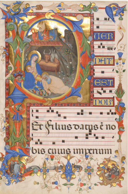
Christmas Day, Florence, Italy, ca. 1392–99. The Morgan Library & Museum, MS M.653.1.