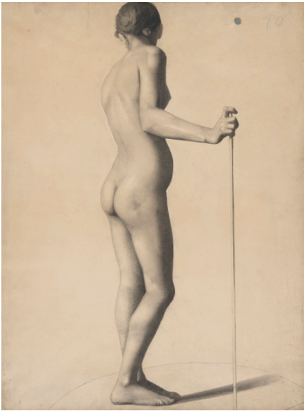
Georges Seurat (French, 1859–1891), Academy Female Nude, seen from Behind , ca. 1877. The Morgan Library & Museum, 2023.53r.

Gifts and Purchases valued at $5,000 or more, April 1, 2023–March 31, 2024