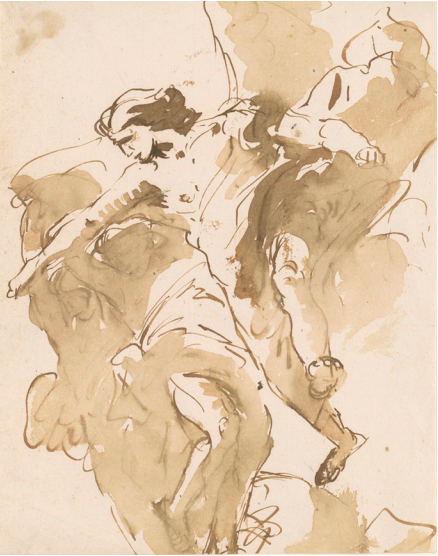
Giovanni Battista Tiepolo (1696–1770), Three Angels in Flight, ca. 1754. Pen and brown ink, brown wash, on paper. The Morgan Library & Museum, IV, 95a.