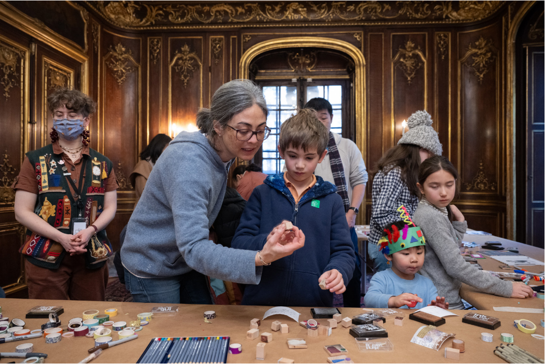
The Winter Family Fair.

MAY 7 Spring Family Fair DECEMBER 10 Winter Family Fair