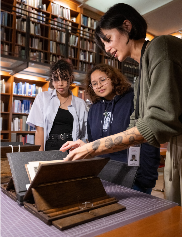
College Night in the Morgan Library & Museum Sherman Fairchild Reading Room.

In late fall, the Reading Room participated in College Night, hosting students from Barnard College, Baruch College, Columbia University, Fordham University, and other postsecondary institutions, as well as art institutes and cultural organizations in the United States and Europe.