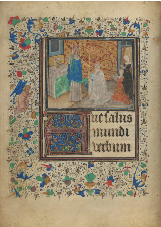
Primer (fragment). Belgium, probably Ghent or Tournai, ca. 1460s. The Morgan Library & Museum, MS M.1241, fol. 3v.