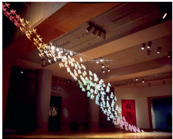
An earlier version of The Living Word by Xu Bing, Arthur M. Sackler Gallery, Smithsonian Institution, Washington, D.C. 2001.

Xu Bing has described The Living Word as a “floating, iridescent cloud of calligraphy” that traces the Chinese character niao , meaning “bird,” from its present-day usage in simplified Chinese to its ancient pictographic expression. The Morgan installation will comprise approximately 400 carved and painted acrylic characters, rising from the Gilbert Court's floor to its fifty-foot ceiling. It will be the largest of The Living Word series to date. A selection of the artist's original sketches for the project will also be on view.