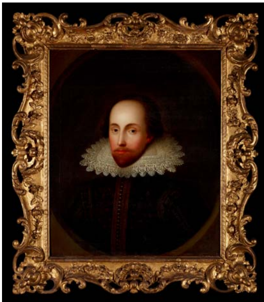
3. Artist Unknown Nineteenth century Portrait of William Shakespeare Oil on linen, laid down on panel 30 x 25 inches (76.2 x 63.5 cm) AZ140. Purchased by Pierpont Morgan, 1910.