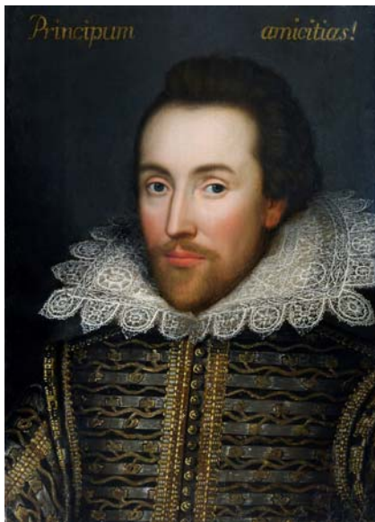
1. Artist Unknown Seventeenth Century (c.1610) William Shakespeare Oil on panel 24 ¼ x 14 ¾ inches (53.9 x 37.5 cm) Collection of Archbishop Charles Cobbe (1686–1765), Cobbe Collection