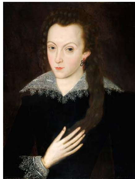
2. John de Critz the elder [attributed to] Flemish, Antwerp 1551/52–1642 London Henry Wriothesley, 3rd Earl of Southampton, as a Youth Oil on panel 24 x 17 ¼ inches (61 x 43.8 cm) Collection of Archbishop Charles Cobbe (1686–1765), Cobbe Collection