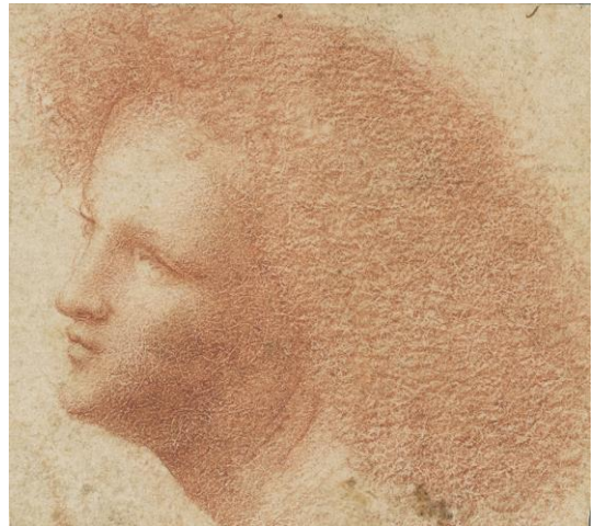
Giovanni Agostino da Lodi (active ca. 1467 - ca. 1524), Head of a Youth Facing Left , 15th century, red chalk on paper. The Morgan Library & Museum, 1973.35:2, Gift of János Scholz.

The Morgan's impressive collection of Italian Drawings documents the development of Renaissance drawing practice from its beginnings in the fourteenth century and over the following two centuries. From the influence of medieval manuscript and painting workshops to the new practice of sketching, artists gradually moved away from imitation of standard models and to the invention of novel ways of thinking on the page and representing traditional subjects. As artists came to be recognized more as intellectuals than as craftsmen, a new class of collectors and