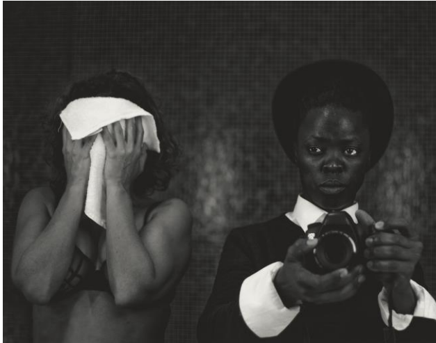
Zanele Muholi, ZaVa, Amsterdam, 2014 . National Gallery of Canada. Courtesy of the artist, Yancey Richardson, New York, and Stevenson Cape Town / Johannesburg.

Through a selection of around seventy works, The Extended Moment reveals the historical, technological, and aesthetic richness of the photography holdings of the National Gallery of Canada, a major collection little known in this country. In the exhibition's presentation at the Morgan, works of far-flung origins appear side-by-side in a sequence that highlights recurring trends and tensions in the history of the medium. Surprising parallels and hidden histories link images drawn from the worlds