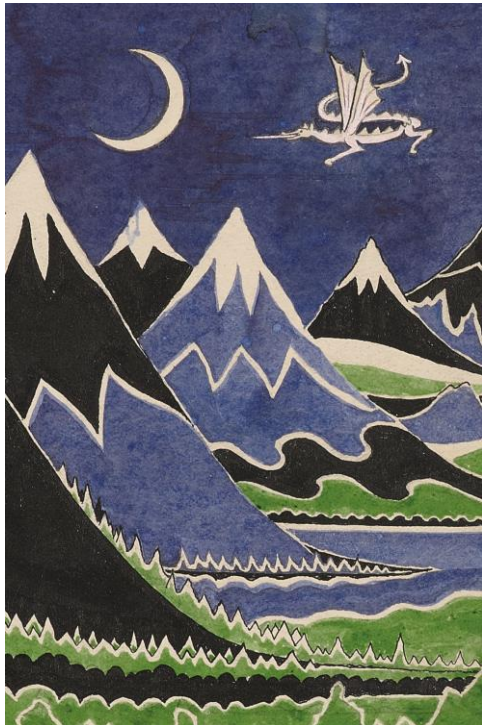
J. R. R. Tolkien (1892–1973), Crop of dust jacket design for The Hobbit , April 1937, pencil, black ink, watercolor, gouache. Bodleian Libraries, MS. Tolkien Drawings 32. © The Tolkien Estate Limited 1937.