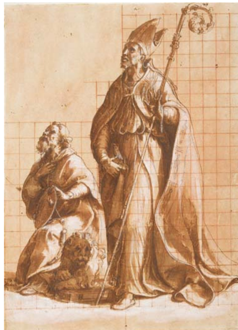
11 Giulio Romano (1499–1546) St. Jerome and St. Augustine Pen and brown ink, brown wash, heightened with white gouache, on pink toned paper; squared in red chalk 10 3/4 x 7 7/8 inches (273 x 201 mm) Gift of Janos Scholz; 1973.24 Photography: Graham Haber, 2009.