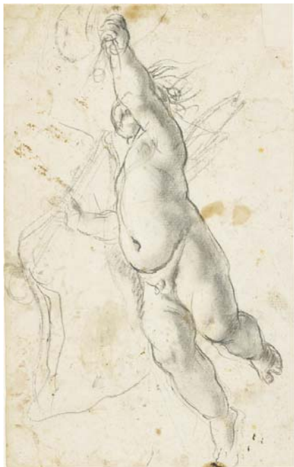
10 Annibale Carracci (1560–1609) Flying Putto Black chalk, stumped 11 5/8 x 7 1/8 inches (295 x 182 mm) Purchased on the Fellows Fund; 1975.3