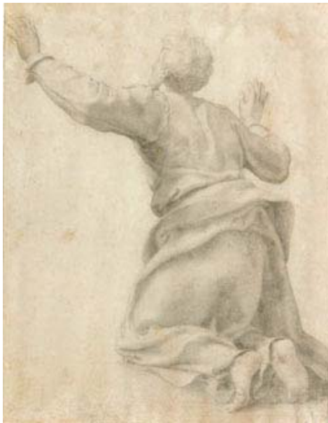
15 Daniele da Volterra (ca. 1509–1566) Kneeling Figure Seen From Behind Black chalk 12 7/8 x 9 7/8 inches (327 x 252 mm) Purchased on the Edwin H. Herzog Fund and Lois and Walter C. Baker Fund; 2001.39