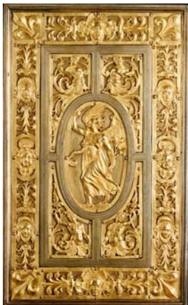
22 Antonio Gentili (1519–1609) Farnese Hours (front cover) Italy, Rome, ca. 1589 Purchased by Pierpont Morgan, 1903