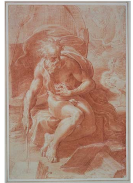
3 Parmigianino (1503–1540) Diogenes Red chalk, heightened with white 10 15/16 x 7 3/8 inches (277 x 187 mm) Private collection, New York