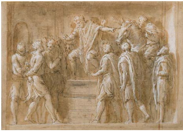
20 Polidoro da Caravaggio (ca. 1495–ca. 1543) Condemnation of Perillus Pen and brown ink, brown wash, heightened with white gouache, over black chalk, on light brown paper 6 1/2 x 9 1/8 inches (165 x 232 mm) Purchased by Pierpont Morgan, 1910; I, 20