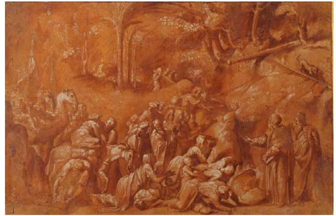
19 Circle of Baldassare Peruzzi Moses Striking Water From the Rock, 1520–40 Pen and brown ink, brown wash, heightened with white gouache, on brown prepared paper 10 1/4 x 15 11/16 inches (261 x 398 mm) Purchased by Pierpont Morgan, 1910; IV, 19