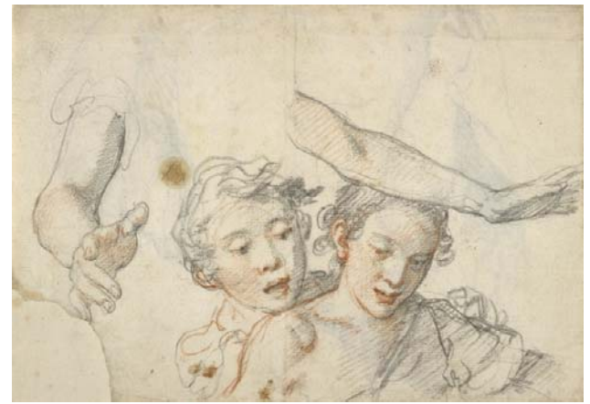
24 Federico Zuccaro (1542 or 43–1609) Head and Shoulders of Two Young Boys and Separate Studies of a Right and Left Arm Black and red chalk 5 9/16 x 8 1/8 (144 x 207 mm) Gift of Janos Scholz; 1974.24

For high resolution images, please contact Sandra Ho, The Morgan Library & Museum at sho@themorgan.org or (212) 590-0311.