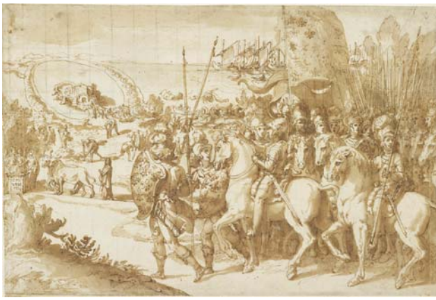
13 Taddeo Zuccaro (1529–1566) The Foundation of Orbetello Pen and brown ink, brown wash, over black chalk; incised for transfer; squared in black chalk 10 3/8 x 15 5/16 inches (264 x 391 mm) Gift of Janos Scholz; 1973.28 Photography: Graham Haber, 2009.