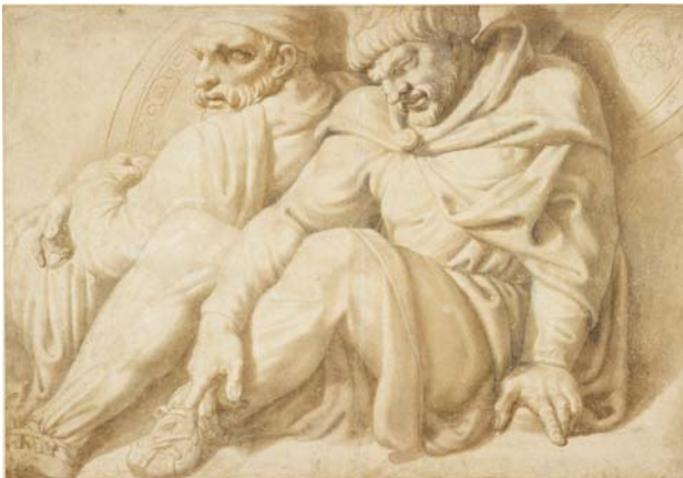
18 Pellegrino Tibaldi (1527–1596) Two Seated Barbarian Captives Pen and brown ink, brown wash, heightened with white gouache, over black chalk 10 7/8 x 15 9/16 inches (274 x 395 mm) Purchased by Pierpont Morgan, 1910; I, 37