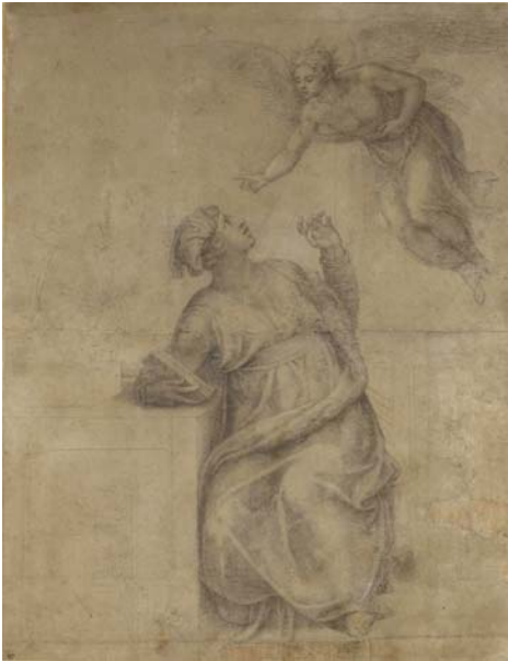
1 Michelangelo Buonarroti (1475–1564) Annunciation to the Virgin Black chalk, some stumping; traced with a stylus 15 1/8 x 11 11/16 inches (383 x 297 mm) Purchased by Pierpont Morgan, 1910; IV, 7