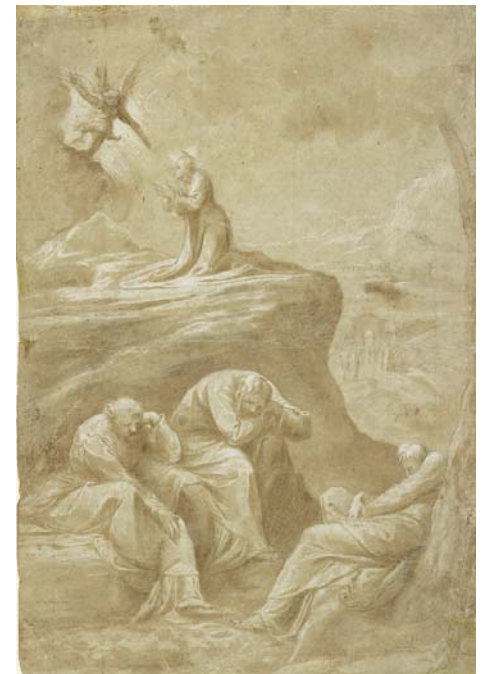
12 Polidoro da Caravaggio (ca. 1495–ca. 1543) Christ on the Mount of Olives Pen and brown ink, brown wash, heightened with white gouache, over black chalk, on blue paper, faded to gray-green; squared for transfer in black chalk 15 1/16 x 10 1/14 inches (382 x 260 mm) Gift of Janos Scholz; 1979.55