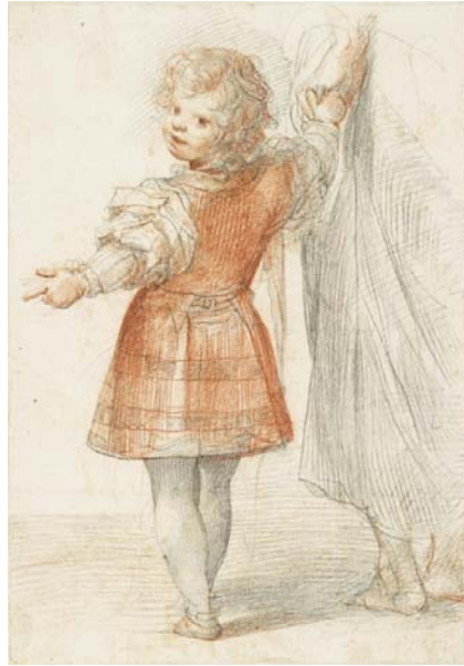
16 Giuseppe Cesari (1568–1640) Child Walking, Looking Over Its Shoulder Black and red chalk 12 x 8 7/16 inches (305 x 215 mm) Purchased by Pierpont Morgan, 1910; IV, 161A