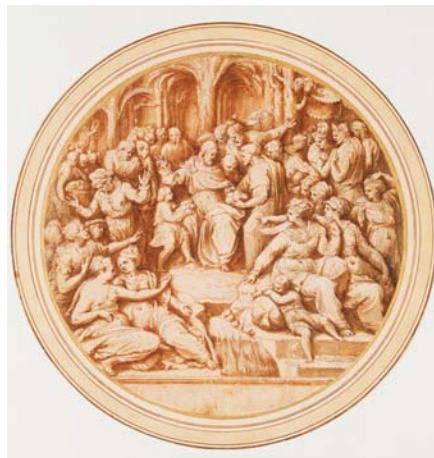
5 Perino del Vaga (1500 or 1501–1547) Miracle of the Loaves and Fishes Pen and brown ink, brown wash, heightened with white gouache, over black chalk 8 3/8 inches diameter (213 mm) Purchased by Pierpont Morgan, 1910; I, 37