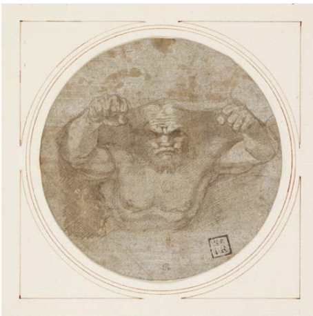
4 Raphael (1483–1520) Male Figure Symbolizing an Earthquake Metalpoint, heightened with white, on gray prepared paper 4 1/4 inches diameter (108 mm) Gift of Janos Scholz; 1977.45