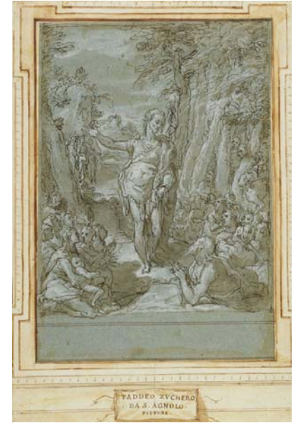
17 Taddeo Zuccaro (1529–1566) St. John the Baptist Preaching Pen and brown ink, brown wash, heightened with white gouache, on blue paper 13 1/4 x 9 5/16 inches (336 x 236 mm) Gift of Janos Scholz; 1973.26