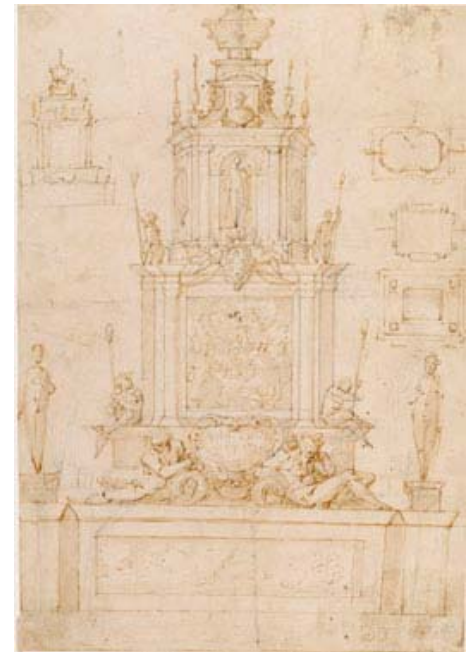
9 Jacopo Zucchi (ca. 1541–1590) Design for the Catafalque of Grand Duke Cosimo I , 1574 Pen and brown ink, brown wash, over black chalk 14 3/4 x 10 3/16 inches (375 x 259 mm) Purchased as the gift of the Fellows; 1965.5