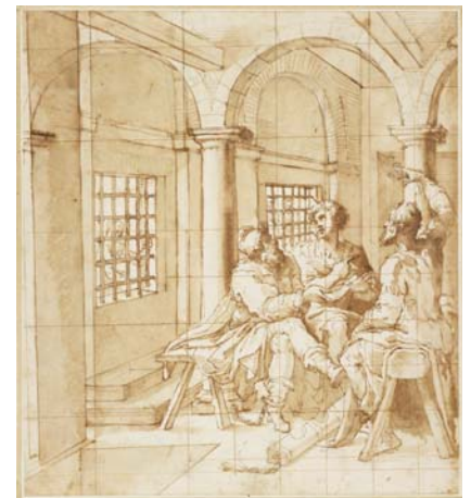
6 Jacopo Bertioia (1544–ca. 1573) Joseph in Prison Interpreting the Dreams of Pharaoh's Butler and Baker (Genesis 40:1-23) Pen and brown ink, with brown wash, over black chalk; squared in pen and brown ink 9 11/16 x 8 11/16 inches (246 x 221 mm) Purchased by Pierpont Morgan, 1910; III, 141A