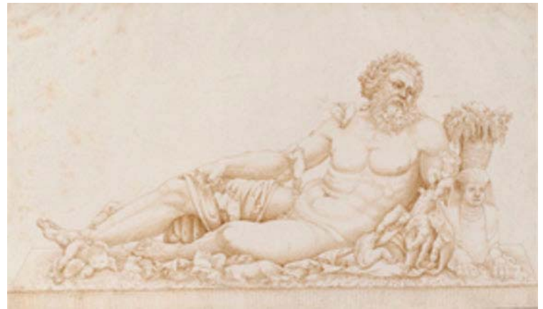
21 Enea Vico (1523–1567) River God Nile after the Antique (Tiber) , early 1540s Pen and brown ink, over traces of black chalk 7 1/16 x 12 1/16 inches (178 x 306 mm) Purchased by Pierpont Morgan, 1910; IV, 50