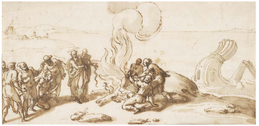
14 Cesare Nebbia (ca. 1536–1614) St. Paul on Malta Pen and brown ink, brown wash, over black chalk 7 1/2 x 15 3/8 inches (190 x 391 mm) The Joseph F. McCrindle Collection, The Morgan Library & Museum; 2009.221