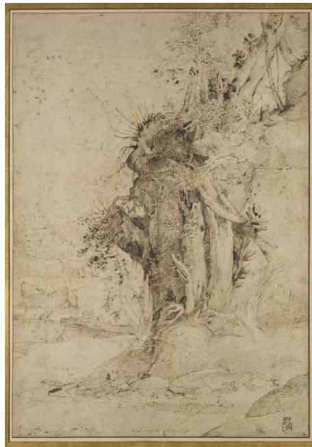
8 Annibale Carracci (1560–1609) Eroded Riverbank with Trees and Roots Pen and brown ink 15 13/16 x 11 1/16 inches (402 x 280 mm) Purchased in 1972; 1972.6