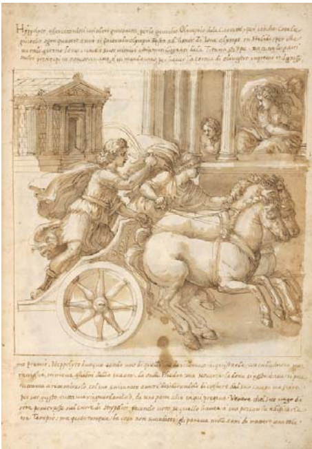
7 Pirro Ligorio (ca. 1510–1583) Page from Life of Hippolytus , “Hippolytus Racing His Horses” Pen and brown ink, with brown and gray wash, over black chalk 12 3/4 x 8 3/4 inches (324 x 222 mm) Purchased by Pierpont Morgan, 1909; 2006.22, folio 8