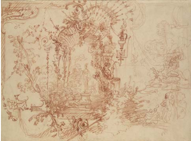
Antoine Watteau (1684–1721) Temple of Diana , 1716 Red chalk 10 1/2 x 14 1/4 inches (267 x 362 mm) Purchased on the Sunny Crawford von Bülow Fund 1978; 1980.9