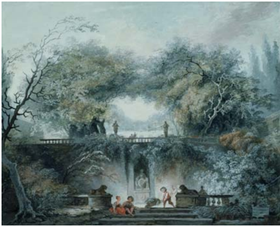
Jean-Honoré Fragonard (1732–1806) Interior of a Park: The Gardens of Villa d'Este Gouache on vellum 7 3/4 x 9 1/2 inches (197 x 242 mm) Thaw Collection, The Morgan Library & Museum; 1997.85