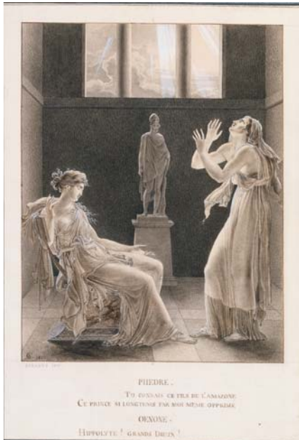
Anne-Louis Girodet-Trioson (1767–1824)

Phaedra Confesses Her Love for Hippolytus to Oenone