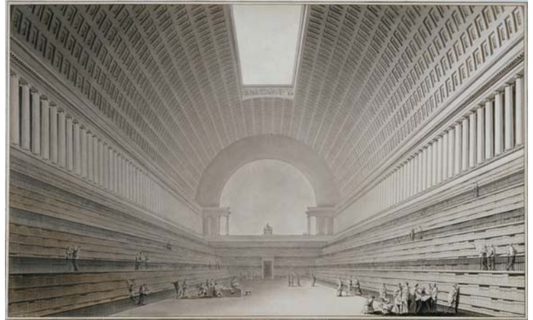
Étienne Louis Boullée (1728–1799) Interior of a Library Pen and black and some brown ink, gray wash, over traces of black chalk; compass point at center; ruled borders in pen and black ink 15 7/8 x 25 5/8 inches (420 x 653 mm) Thaw Collection, The Morgan Library & Museum