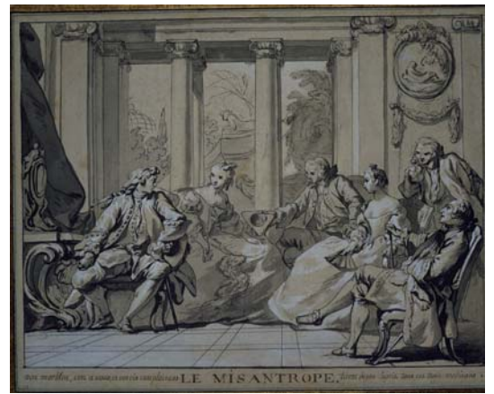
Jean-Baptiste-Marie Pierre (1714–1789) Le Misanthrope , act 2, scene 4, ca. 1750–55 Pen and black ink, brush and gray wash, over black chalk, heightened with white gouache, on blue paper 8 3/4 x 11 inches (220 x 280 mm) Purchased as the gift of Joan Taub Ades and on the Lois and Walter C. Baker Fund; 2006.5