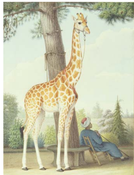
Nicolas Hüet (1770–1828) Study of the Giraffe Given to Charles X by the Viceroy of Egypt , 1827 Watercolor and some gouache, over traces of black chalk 10 1/16 x 7 5/8 inches (254 x 194 mm) Purchased on the Sunny Crawford von Bülow Fund 1978; 1994.1