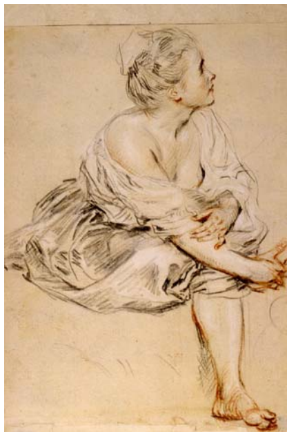
Antoine Watteau (1684–1721) Seated Young Woman , ca. 1716 Black, red, and white chalk 10 x 6 3/4 inches (255 x 172 mm) Purchased by Pierpont Morgan, 1911; I, 278a