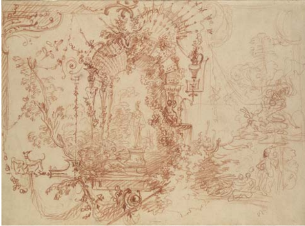
Antoine Watteau (1684–1721)