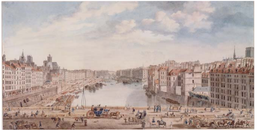
Louis Nicolas de Lespinasse (1734–1808) View of the Banks of the Seine, Paris Pen and brown ink and watercolor, heightened with white, over preliminary drawing in graphite 12 7/8 x 24 13/16 inches (326 x 630 mm) Purchased on the Lois and Walter C. Baker Fund; 1994.17