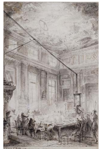
Gabriel Jacques de Saint-Aubin (1724–1780) The Lesson of the Chemist Sage at the Hôtel des Monnaies , 1779 Black chalk with some stumping and graphite, point of brush and brown ink, gray wash, some bodycolor 7 7/8 x 5 1/16 inches (198 x 128 mm) Purchased on the Sunny Crawford von Bülow Fund 1978; 1991.4