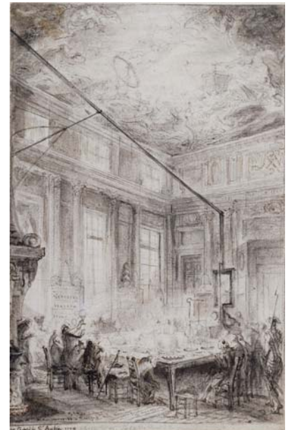
Gabriel Jacques de Saint-Aubin (1724–1780)

The Lesson of the Chemist Sage at the Hôtel des Monnaies , 1779