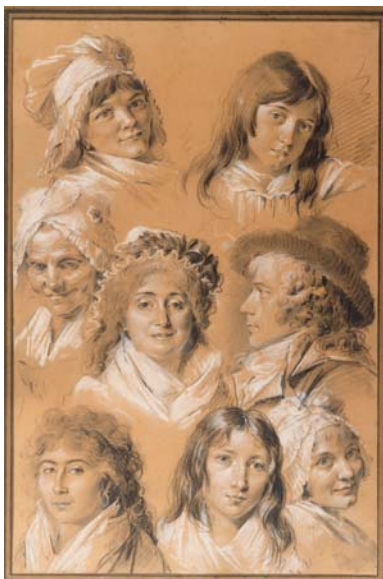
Louis-Léopold Boilly (1761–1845) Portraits of the Artist's Family and Servants Black and white chalk, on light brown wove paper 17 13/16 x 11 11/16 inches (450 x 297 mm) Thaw Collection, The Morgan Library & Museum