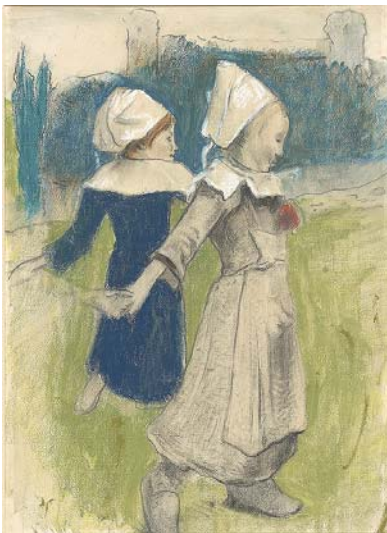
Paul Gauguin (1848–1903) Study for Breton Girls Dancing, Pont-Aven, 1888 Pastel and charcoal, with watercolor and gouache The Morgan Library & Museum Thaw Collection, 2010