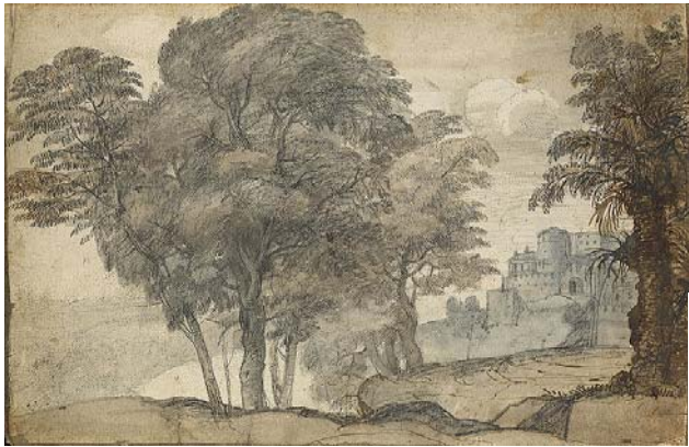
Claude Gellée, called Claude Lorraine (French, 1600–1682) Heroic Landscape , ca. 1650 Black chalk, pen and brown ink, brown, gray, and blue wash Thaw Collection, 2010