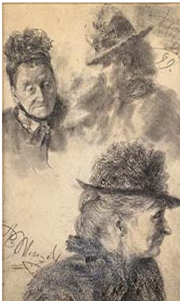
Adolph Menzel (German, 1815–1905) Three Studies of Elderly Women , 1899 Graphite Charles Ryskamp Bequest, 2010