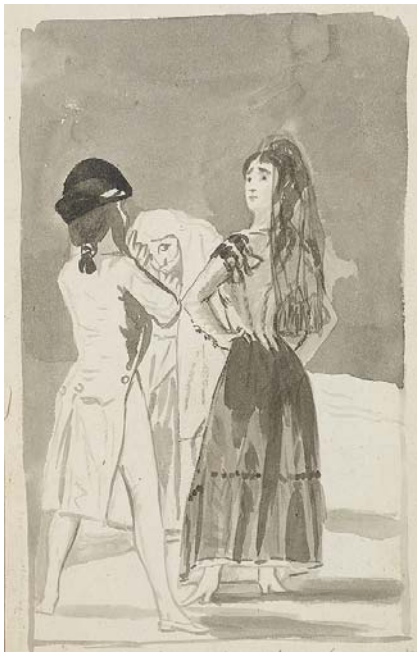
Francisco Goya (1746–1828) Just Because She Is Asked If Her Mother Is Well She Acts Like a Tigress, 1796–97 Gray wash The Morgan Library & Museum Thaw Collection, 2010

**Press Preview: Thursday, May 30, 2013, 10–11:30 a.m.** RSVP: (212) 590-0393, media@themorgan.org