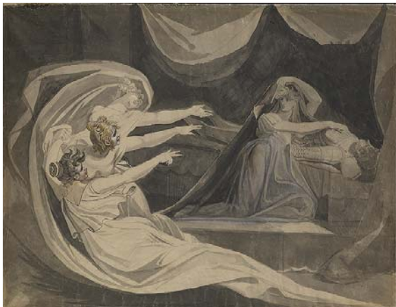
Johann Heinrich Fuseli (Swiss, active in England, 1741–1825) Kriemhild at the Wake of Siegfried , 1805 Gray wash, watercolor, with white heightening, over graphite Thaw Collection, 2010