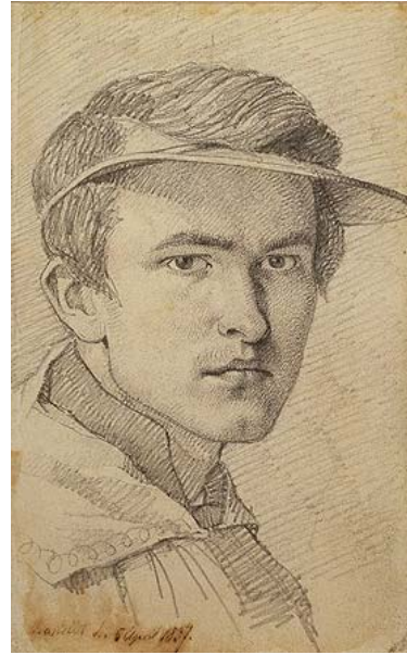
Johan Thomas Lundbye (1818–1848) Self-Portrait, 1837 Graphite Charles Ryskamp Bequest, 2010 The Morgan Library & Museum

Particularly significant is a selection of late-nineteenth-century French drawings by such artists as Manet, Cézanne, Vuillard, and Redon, which greatly strengthen the Morgan's holdings in Impressionist, Post-Impressionist, and Symbolist works. More than forty Danish drawings form another important group, including sheets by several Golden Age masters, among them C.W. Eckersberg and Johan Lundbye. Outstanding watercolors by British artists, notably John Martin and Samuel Palmer, reveal their mastery of the medium and virtuosity of technique. Highlights among the purchases on view include a delicate sheet of studies by Perino del Vaga, a beautiful pastel by Benedetto Luti, and a dynamic compositional study by Charles-Joseph Natoire.