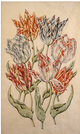
Anthony Claesz (Dutch, ca. 1616–ca. 1652) Seven Tulips with Three Ladybugs , ca. 1635–50 Watercolor and gouache Charles Ryskamp Bequest, 2010