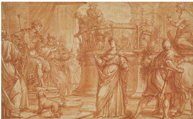
Fabrizio Boschi (Italian, 1570–1642) St. Cecilia Before the Roman Prefect Almachius , ca. 1602–5 Red chalk and red chalk wash, heightened with white; squared in black chalk Purchased on the Lois and Walter Baker Fund, 2011