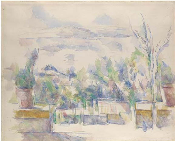
Paul Cézanne (French, 1839–1906) The Terrace at the Garden at Les Lauves , 1902–6 Watercolor, over graphite Thaw Collection, 2010