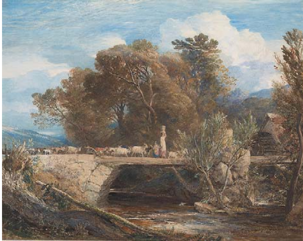
Samuel Palmer (British, 1805–1881) Crossing the Bridge , 1847 Watercolor, gouache, and graphite Purchased on the Sunny Crawford von Bülow Fund 1978, 2011