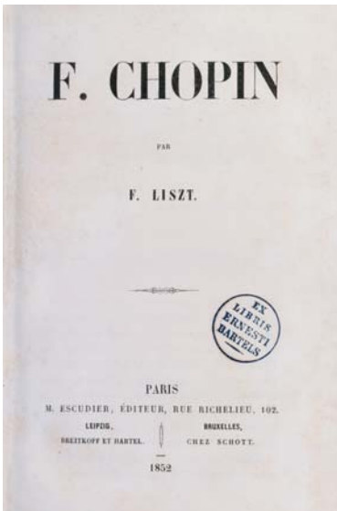
Franz Liszt F. Chopin Paris: M. Escudier, 1852 PMC 2022; The Mary Flagler Cary Music Collection, The Morgan Library & Museum