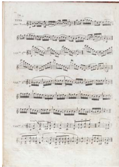
Franz Liszt 24 Grandes Études Vienna: Tob. Haslinger, [1839] First Austrian edition pmc 2028; The Mary Flagler Cary Music Collection, The Morgan Library & Museum