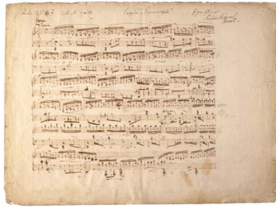
Frédéric Chopin Étude [op. 10, no. 3] Autograph manuscript draft, dated 25 August 1832 The Robert Owen Lehman Collection, on deposit, The Morgan Library & Museum