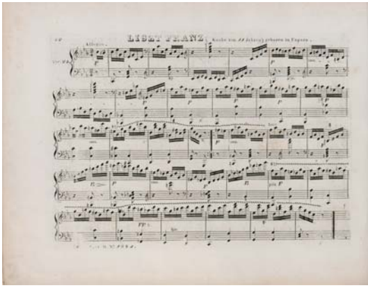
50 Veränderungen über einen Walzer für das Piano-Forte Vienna: A. Diabelli, 1824 First edition PMC 1270; The Mary Flagler Cary Music Collection, The Morgan Library & Museum