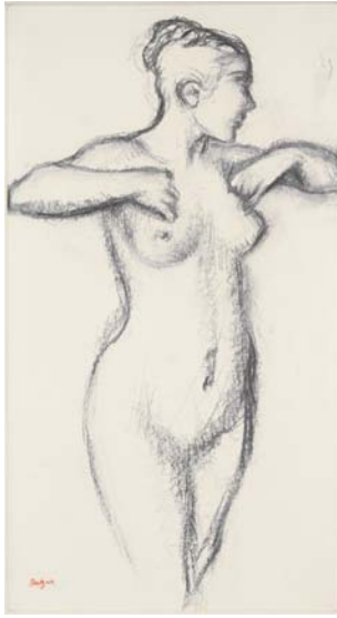
7. Edgar Degas (1834–1917) Study for a Dancer Adjusting Her Bodice , ca. 1897 Charcoal 18 1/2 x 10 1/4 inches (47 x 26 cm) Kasper Collection, Promised gift to The Morgan Library & Museum