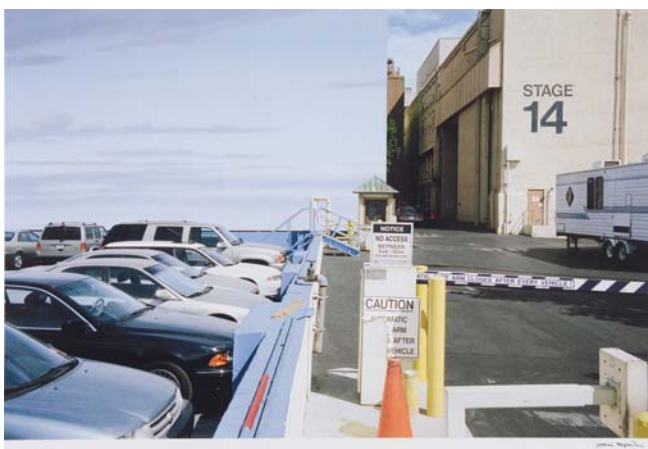
14. William Eggleston (b. 1939) Stage 14, Parking Lot, Hollywood , 1999–2000 Iris print 24 x 30 inches (61 x 76.2 cm) Kasper Collection