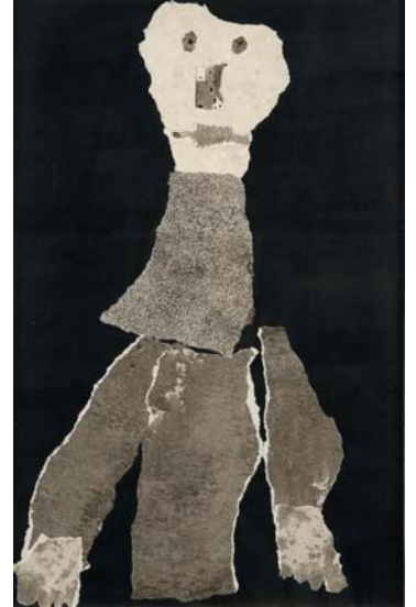
11. Jean Dubuffet (1901–1985) Clairvoyant Beard (Barbe de Voyance), 1959 Paper collage and black ink 20 x 13 3/8 inches (51 x 34 cm) Kasper Collection, Promised gift to The Morgan Library & Museum © 2010 Artists Rights Society (ARS), New York / ADAGP, Paris