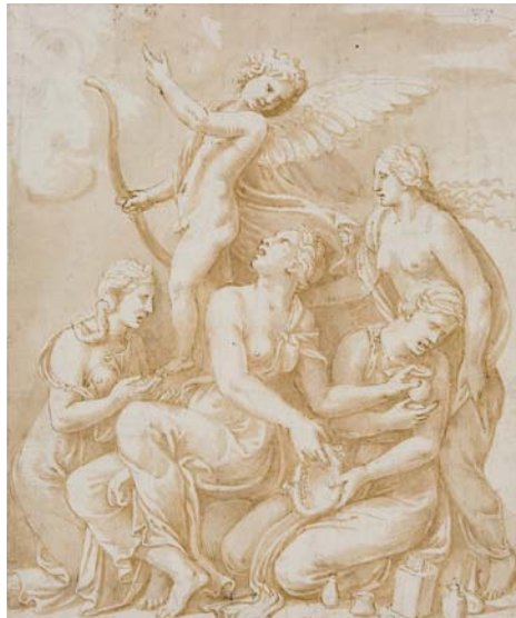
2. Giulio Romano (Giulio Pippi) (ca. 1499–1546) Cupid and Psyche and Other Figures , 1524–40 Pen and brown ink, brown wash 8 1/2 x 7 1/8 inches (21.6 x 18.1 cm) Kasper Collection