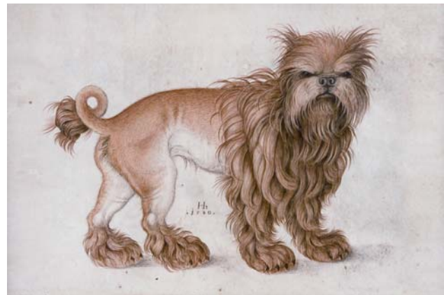
5. Hans Hoffmann (1540/50–1591/92) An Affenpinscher , 1580 Watercolor and gouache on vellum 10 x 14 1/4 inches (25.5 x 36 cm) Kasper Collection