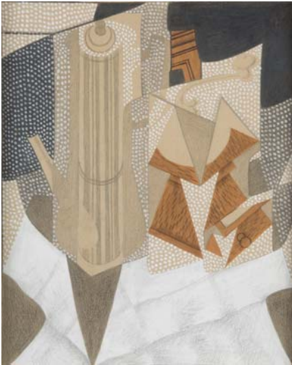
9. Juan Gris (1887–1927) Coffee Grinder , 1916 Gouache and graphite pencil 18 1/4 x 11 5/8 inches (45.7 x 27.9 cm) Kasper Collection