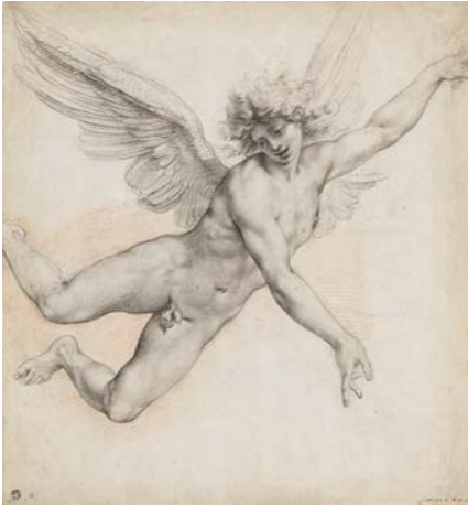
6. Giuseppe Cesari (il Cavaliere d'Arpino) (1568–1640) An Angel in Flight , ca. 1596–1599 Black and red chalk 15 3/8 x 14 1/4 inches (39.1 x 36.2 cm) Kasper Collection