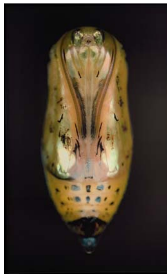
15. Adam Fuss (b. 1961) Untitled , 2003 Pigment print 72 x 44 inches (182.9 x 111.8 cm) Kasper Collection © Adam Fuss Courtesy Cheim & Read, New York

For high resolution images, please contact Sandra Ho, The Morgan Library & Museum at sho@themorgan.org or (212) 590-0311.