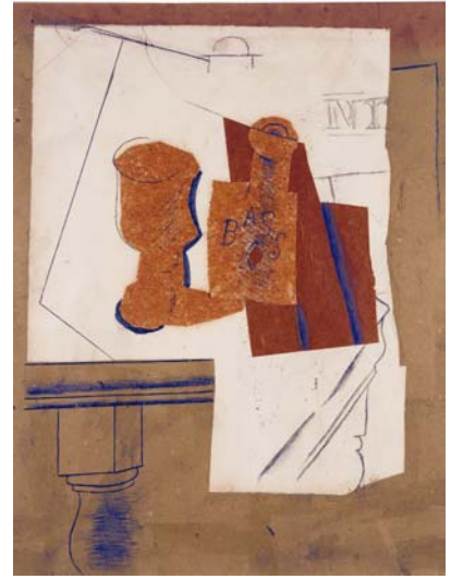
8 Pablo Picasso (1881–1973) Glass and Bass Bottle on a Table , 1913 Collage, wash, sawdust, and graphite pencil on cardboard 23 1/2 x 17 1/2 inches (59.7 x 44.4 cm) Kasper Collection © 2010 Estate of Pablo Picasso / Artists Rights Society (ARS), New York