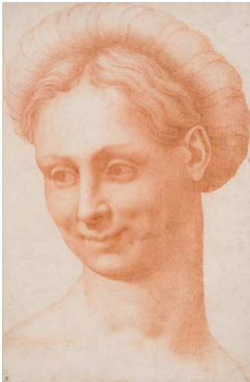
1. Baccio Bandinelli (1493–1560) Head of a Woman Wearing a Ghirlanda Red chalk 11 1/4 x 7 1/8 inches (28.6 x 18.1 cm) Kasper Collection