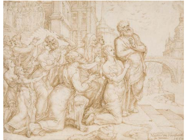
3. Maarten van Heemskerck (1498–1574) Susanna and Her Relatives Praising the Lord (Daniel 13:63), 1562 Pen and brown ink over black chalk with some of the outlines incised; later addition of framing lines in brown ink 7 5/8 x 9 7/8 inches (19.3 x 25 cm) Kasper Collection