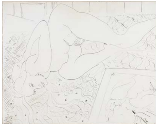
10. Henri Matisse (1869–1954) Large Nude , 1935 Pen and black ink 17 3/4 x 22 1/4 inches (45.1 x 56.5 cm) Kasper Collection © 2010 Succession H. Matisse / Artists Rights Society (ARS), New York