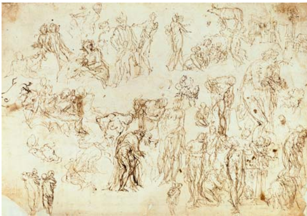
4. Paolo Veronese (1528–1588) Sheet of studies for The Consecration of David and for figures and architecture at Villa Barbaro, Maser, ca. 1558–62 Pen and brown ink. Laid down. 8 7/16 x 12 1/4 inches (21.4 x 31.1 cm) Kasper Collection