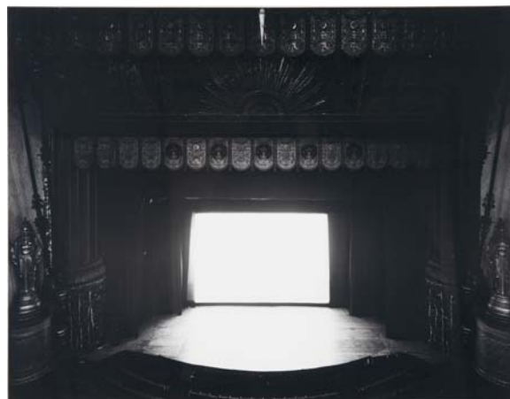
13. Hiroshi Sugimoto (b. 1948) Beacon Theatre, New York , 1979 Gelatin silver print 16 1/2 x 21 1/4 inches (41.9 x 54 cm) Kasper Collection © Hiroshi Sugimoto Courtesy The Pace Gallery