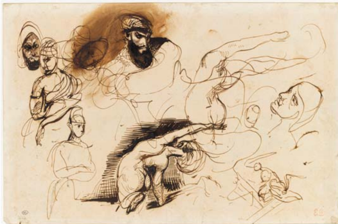
Eugène Delacroix (1798–1863), Study for The Death of Sardanapalus , pen and brown ink and brown wash.

David, Delacroix, and Revolutionary France: Drawings from the Louvre September 23 – December 31, 2011