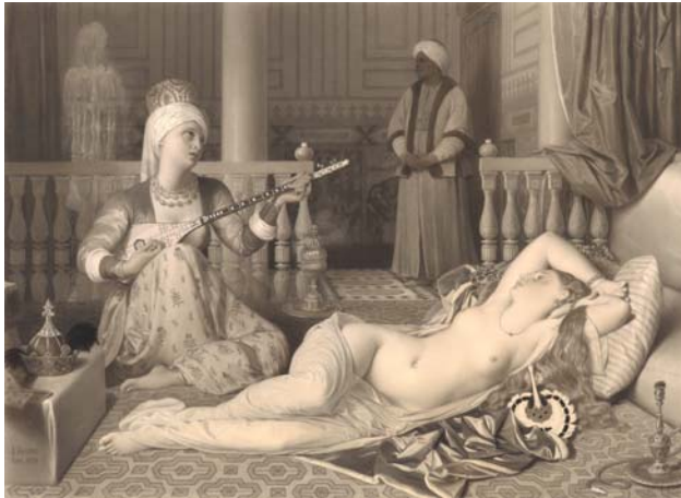
Jean-Auguste-Dominique Ingres (1780–1867), Odalisque and Slave, 1839, graphite, black and white chalk, white gouache, gray and brown wash. Signed, inscribed, and dated at lower left, J. Ingres / Rom. 1839. Thaw Collection, The Morgan Library & Museum.

The Morgan's holdings of drawings by Jean-Auguste-Dominique Ingres (1780–1867) span his career—from his days as a young student in Toulouse, to his tenure as a pensionnaire at the French Academy in Rome, to the 1850s when he ran one of the most preeminent studios in Paris.