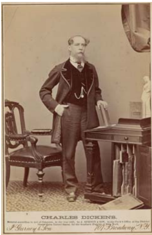
Jeremiah Gurney (1812-1895), Charles Dickens , 1867. Purchased for The Dannie and Hettie Heineman Collection as the gift of the Heineman Foundation, 2011.

Charles Dickens (1812-1870) was Britain's first true literary superstar. In his time, he attracted international adulation on an unprecedented scale, and many of his books became instant classics. Today, his popularity continues unabated, and his work remains not only widely read but widely adapted for stage and screen.