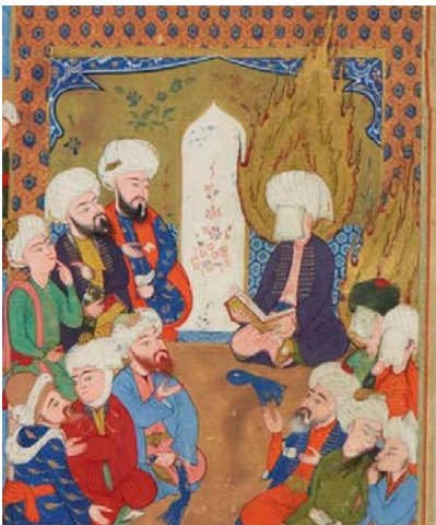
A vision of Muhammad reading Rumi's Masnavi (Couplets) (detail). "A Translation of Stars of the Legends," mostly about the life of Rumi, in Turkish. Baghdad, 1590s. MS M.466, fol. 156. Purchased by Pierpont Morgan, 1911.

The Morgan Library & Museum is internationally acclaimed for its collection of medieval and Renaissance illuminated manuscripts, so it may come as a surprise that the museum also possesses a number of important Islamic manuscripts and single pages dating from the late Middle Ages to the nineteenth century. They include such treasures as a thirteenth-century treatise on animals and their uses, regarded by some experts as one of the greatest of all Islamic manuscripts, and an illustrated Turkish translation of the life of the celebrated Persian poet and mystic, Mevlana Jalal al-Din Rumi, the Morgan copy of which is the more extensively illustrated of the two known to exist.