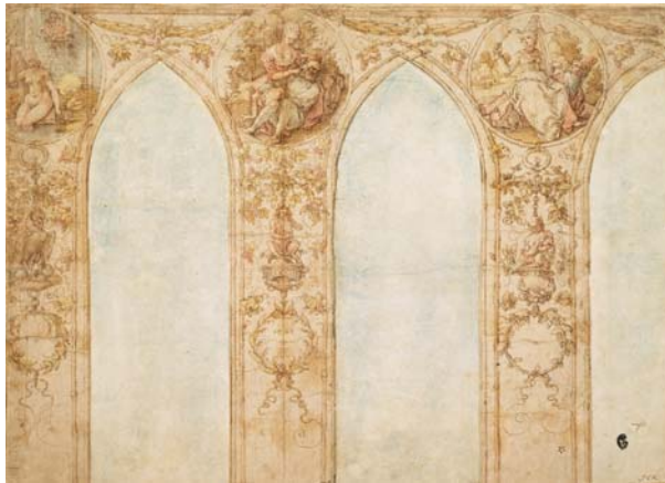
10. Albrecht Dürer Design for Decoration in the Town Hall of Nuremberg , 1521 Pen and brown ink, with watercolor, silhouetted and mounted on another sheet 10 1/16 x 13 13/16 inches (256 x 351 mm) Purchased by Pierpont Morgan, 1910; I, 257