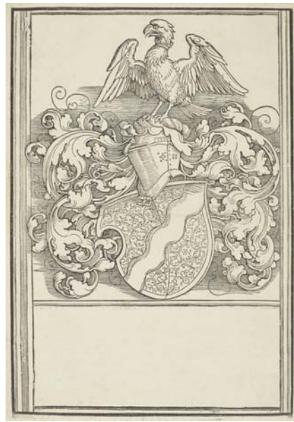
11. Albrecht Dürer Coat of Arms of Michael Behaim , ca. 1520 Woodcut 11 5/8 x 8 1/8 inches (295 x 206 mm) Purchased by the Morgan Library, 1930; 2006.81