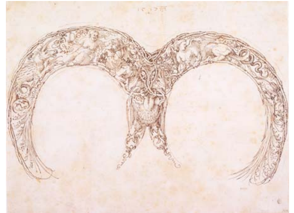
9. Albrecht Dürer Design for the Decoration of a Saddle Pen and dark brown ink 8 5/8 x 11 5/16 inches (220 x 287 mm) Purchased by Pierpont Morgan, 1910; I, 256