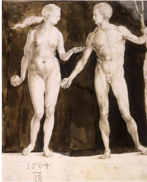
2. Albrecht Dürer Adam and Eve , 1504 Pen and brown ink and brown wash, corrections in white 9 5/8 x 7 15/16 inches (242 x 201 mm) Purchased by Pierpont Morgan, 1910; I, 257d