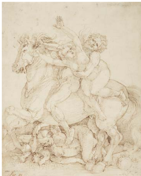
5. Albrecht Dürer Abduction on Horseback , 1516 Pen and brown ink, with traces of underdrawing in black chalk; traced with stylus 9 13/16 x 7 15/16 inches (251 x 201 mm) Purchased by Pierpont Morgan, 1910; I, 257a