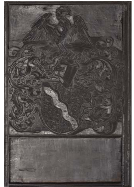
12. Albrecht Dürer Original woodblock for Coat of Arms of Michael Behaim Wood 11 1/8 x 7 3/4 inches (282 x 197 mm) Purchased by J. P. Morgan, Jr., 1926; AZ127

For high resolution images, please contact Sandra Ho, The Morgan Library & Museum at sho@themorgan.org or (212) 590-0311.