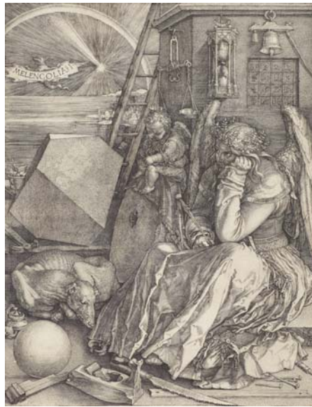
8. Albrecht Dürer Melencolia I , 1514 Engraving 9 7/16 x 7 5/16 inches (240 x 186 mm) Bequest of Belle da Costa Greene; 1950.33