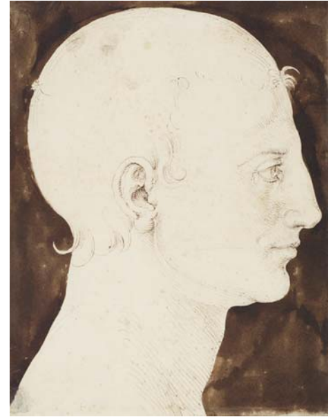
3. Albrecht Dürer Constructed Head of a Man in Profile , ca. 1512-13 Pen and brown ink and dark brown wash 9 9/16 x 7 7/16 inches (244 x 188 mm) Purchased by Pierpont Morgan, 1910; I, 257b