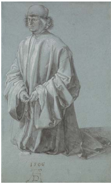
7. Albrecht Dürer Kneeling Donor , 1506 Brush and black ink, gray wash, heightened with white bodycolor, with accents in pen and dark ink, on blue Venetian paper 12 3/4 x 7 11/16 inches (323 x 198 mm) Purchased by Pierpont Morgan, 1910; I, 257c