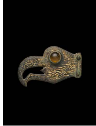
Left: Pair of earrings. Parthian period, first–second century. Middle: Radiate-head bow brooch, ca. 480–510. Right: Eagle-head strap end. Visigothic or Early Byzantine, second half of fifth–sixth century.

pendants, and earrings. The volume demonstrates how the migrating peoples brought sophisticated metalworking traditions to the creation of these objects with clear influences from their interactions over the centuries with the Roman and Byzantine empires.