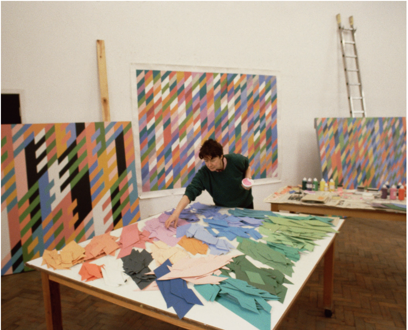
Riley in her London studio, ca. 1990.