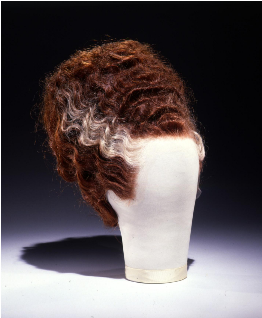
Josephine Turner (1909–2003) and Leland Crawford, reproduction of wig for Elsa Lanchester in The Bride of Frankenstein , 1991. Courtesy of Museum of the Moving Image, New York, gift of Josephine Turner and Leland Crawford, Courtesy of Universal Studios Licensing LLC, © 1935 Universal Pictures Company, Inc.