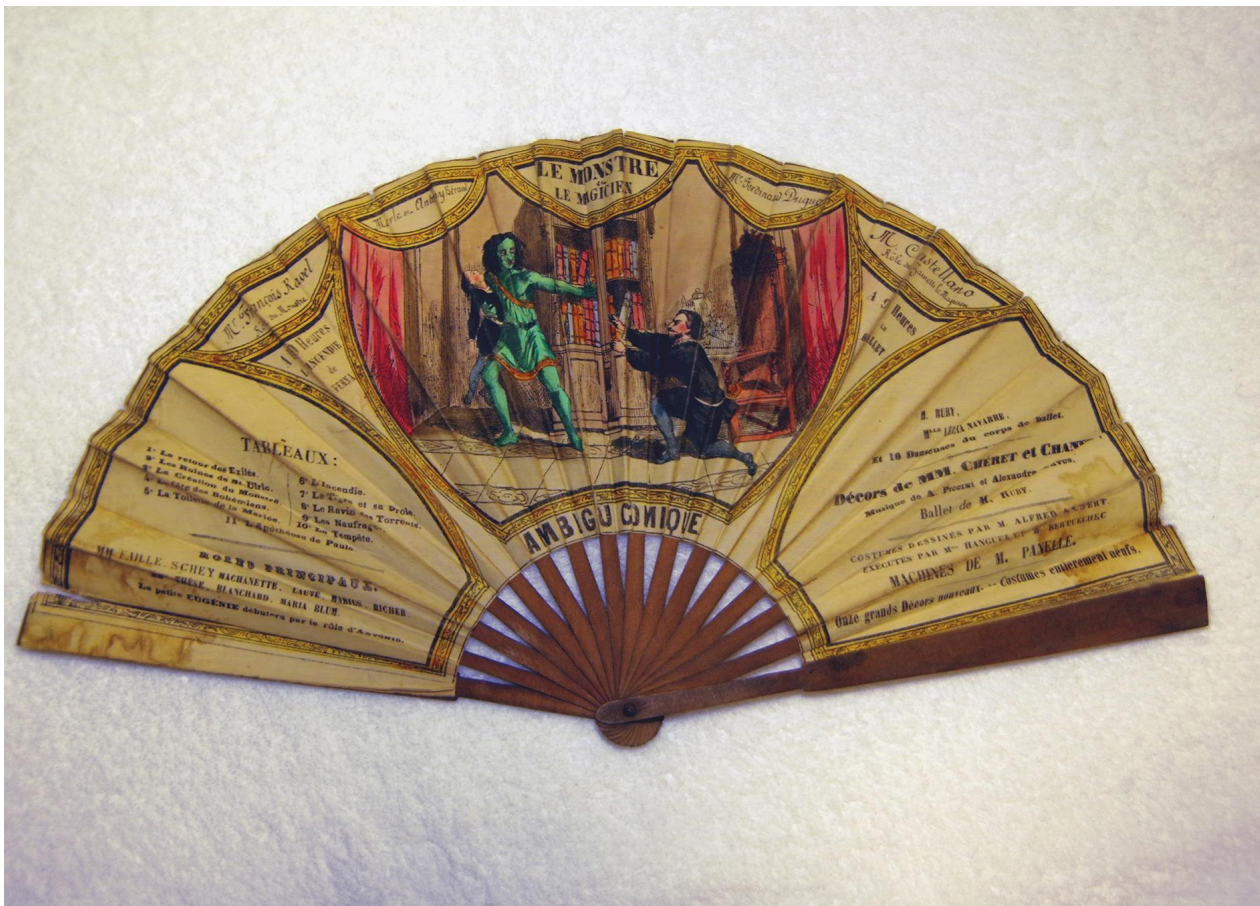
Le Monstre et le magicien.. Ambigu-Comique, souvenir fan, 1861, color lithograph.