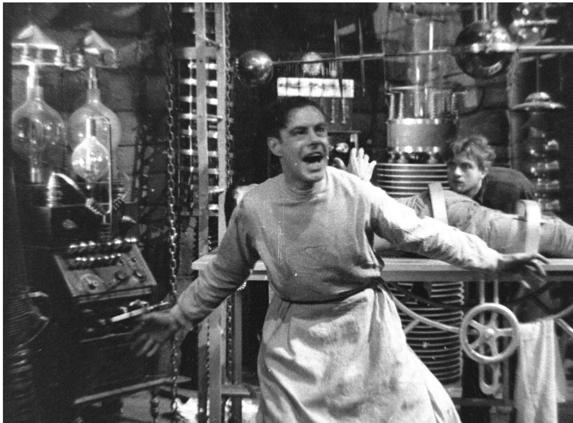
Colin Clive in Frankenstein , movie clip, 1931.