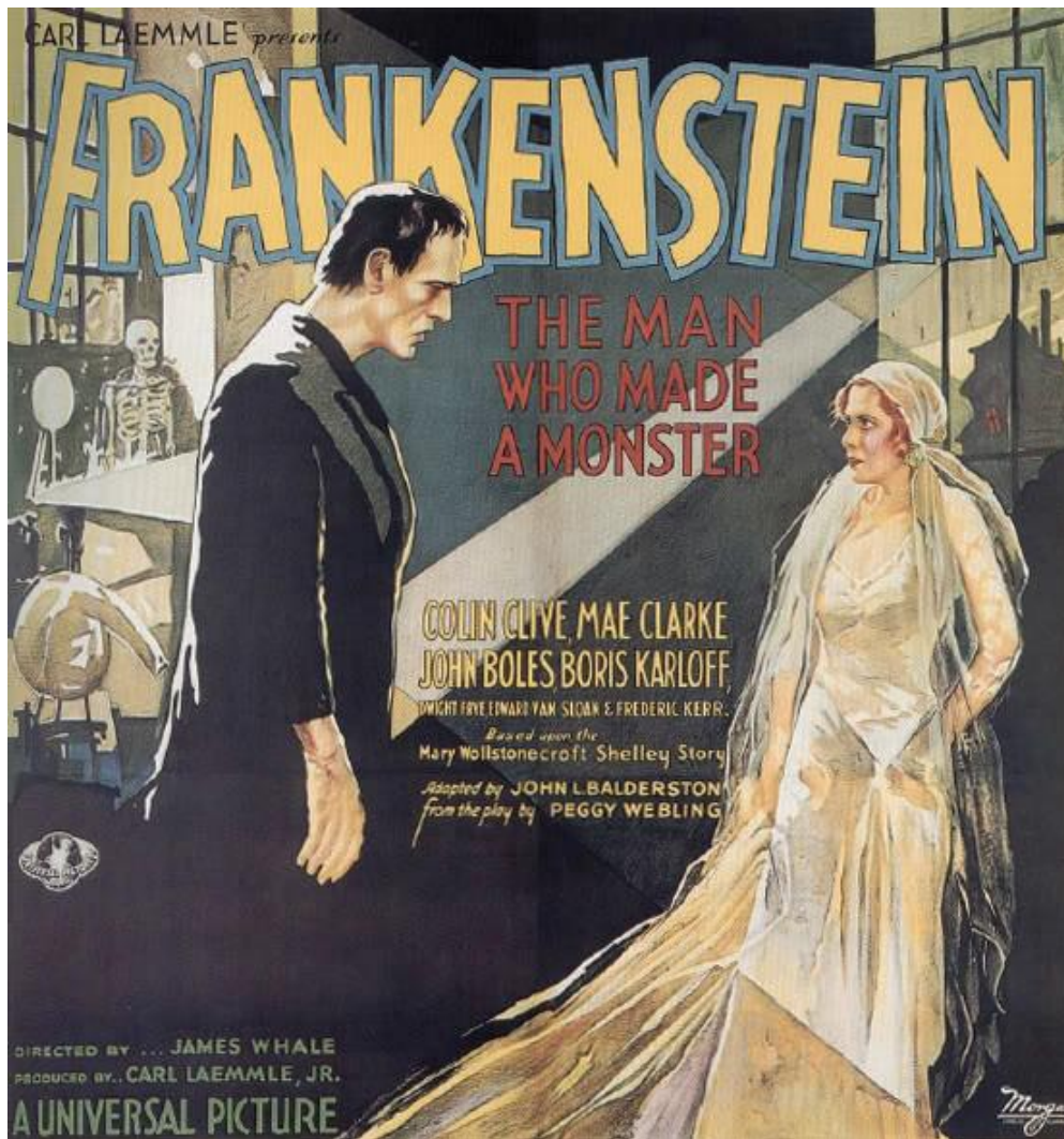
Carl Laemmle Presents Frankenstein: The Man Who Made a Monster, 1931, Lithograph poster.