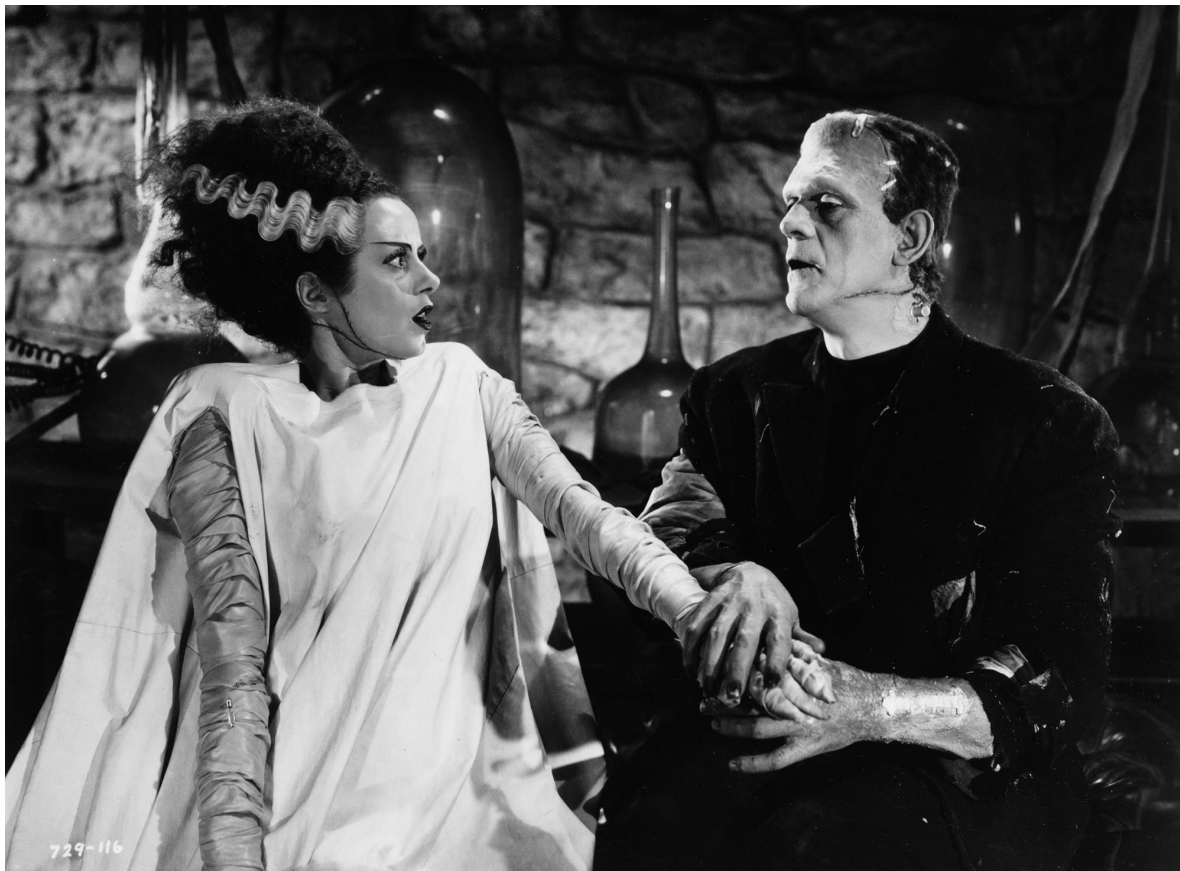
Elsa Lanchester and Boris Karloff in The Bride of Frankenstein, photograph, 1935.