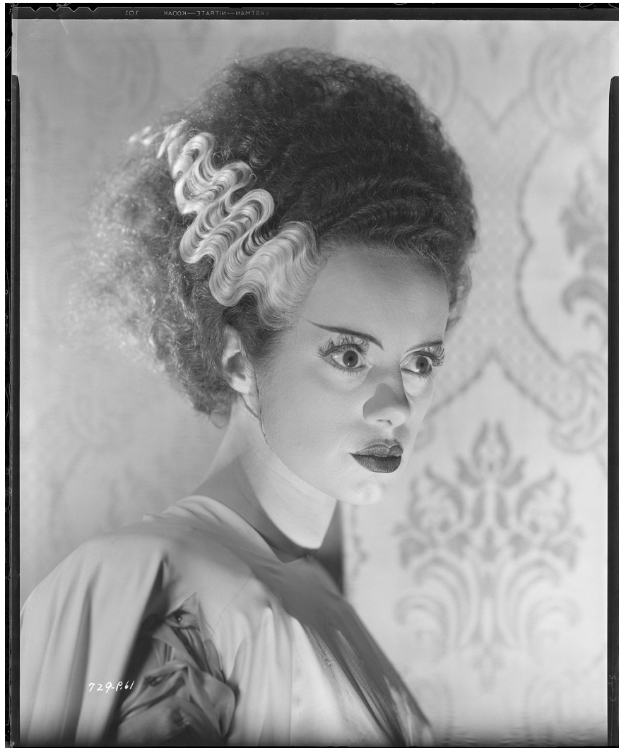
Elsa Lanchester in The Bride of Frankenstein , photograph, 1935.