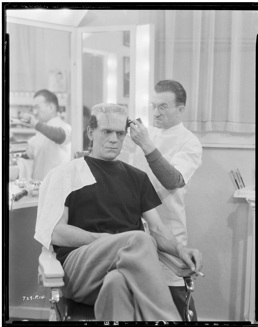
Jack Pierce devising makeup for Boris Karloff as the creature in Bride of Frankenstein, ca. 1935, Photograph.