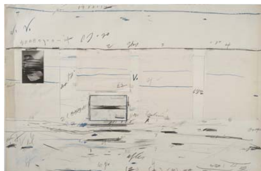
Cy Twombly Untitled (1972) The Menil Collection, Houston, Gift of the artist ©Cy Twombly Foundation