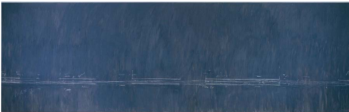
Cy Twombly Treatise on the Veil (Second Version) (1970) The Menil Collection, Houston, Gift of the artist

Executed in Rome in 1970, Treatise on the Veil (Second Version) was inspired by a musical composition and explores Twombly's fascination with time, space, and movement. White lines running across the work's grey surface suggest, in the artist's words, “a time line without time.” The twelve drawings in the exhibition—which combine pencil, crayon, collage, tape, measurements, and other inscriptions—offer an intriguing window into the artist's creative