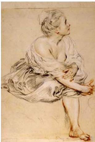
Antoine Watteau, Seated Young Woman , ca. 1716, black, red, and white chalk. Purchased by Pierpont Morgan, 1911:1, 278a.

During the opening years of the eighteenth century, academic traditions yielded increasingly to a preference for spontaneity, charm, and subjects that celebrated the pleasures of love and everyday life. The first and greatest master of this new sensibility, later dubbed the Rococo, was Antoine Watteau (1684–1721).