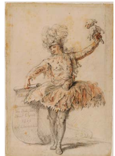
Gabriel Jacques de Saint-Aubin, Momus , 1752, red and black chalk, with touches of white chalk. Purchased as the gift of the Fellows: 1954.9.

Gabriel de Saint-Aubin (1724–1780) worked almost exclusively as a draftsman and printmaker and was the great “society reporter” of pre-Revolutionary Paris. The show includes his small, vivid sketch of a demonstration in the Hôtel des Monnaies by the chemist Balthasar Georges Sage. Also by Saint-Aubin is a lively drawing of a ballet dancer dressed as Momus, the god of banter, holding a scroll advertising costume designs for a ball at the royal residence of St. Cloud.