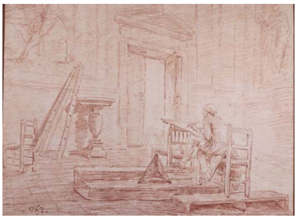
Hubert Robert (1733–1808) Draftsman in an Italian Church , 1763 Red chalk 12 15/16 x 17 5/8 inches (329 x 448 mm) Thaw Collection, The Morgan Library & Museum; 1981.74

Purchased on the Edwin H. Herzog Fund with the special assistance of the International Music and Art Foundation; 1995.10