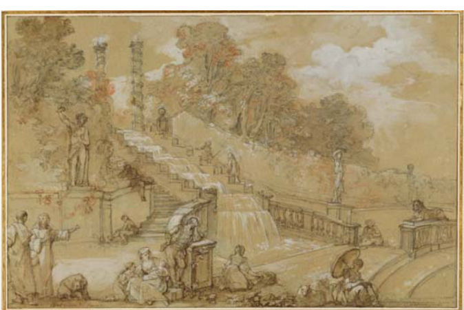
Charles Joseph Natoire (1700–1777) The Cascade at the Villa Aldobrandini, Frascati, 1762 Pen and brown and black ink, brown wash, black and red chalk, heightened with white, on light brown paper 12 x 18 1/2 inches (305 x 469 mm) Purchased as the gift of the Fellows; 1965.18