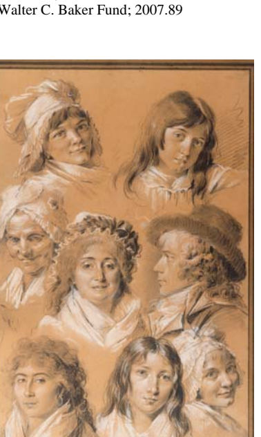
Louis-Léopold Boilly (1761–1845) Portraits of the Artist's Family and Servants Black and white chalk, on light brown wove paper 17 13/16 x 11 11/16 inches (450 x 297 mm) Thaw Collection, The Morgan Library & Museum