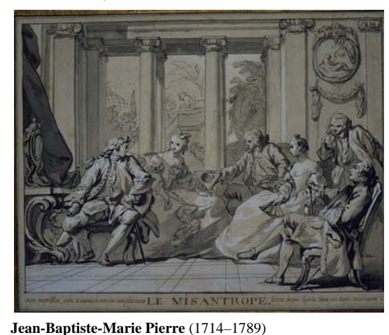
Le Misanthrope, act 2, scene 4, ca. 1750–55 Pen and black ink, brush and gray wash, over black chalk, heightened with white gouache, on blue paper 8 3/4 x 11 inches (220 x 280 mm) Purchased as the gift of Joan Taub Ades and on the Lois and Walter C. Baker Fund; 2006.5