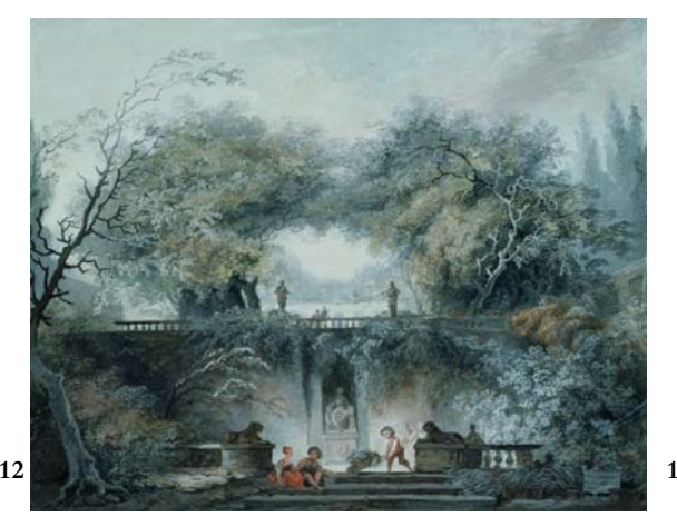
Jean-Honoré Fragonard (1732–1806) Interior of a Park: The Gardens of Villa d'Este Gouache on vellum 7 3/4 x 9 1/2 inches (197 x 242 mm) Thaw Collection, The Morgan Library & Museum; 1997.85