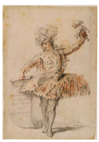
Gabriel Jacques de Saint-Aubin (1724–1780) Momus, 1752 Red and black chalk, with touches of white chalk 13 7/8 x 9 1/2 inches (353 x 242 mm) Purchased as the gift of the Fellows; 1954.9