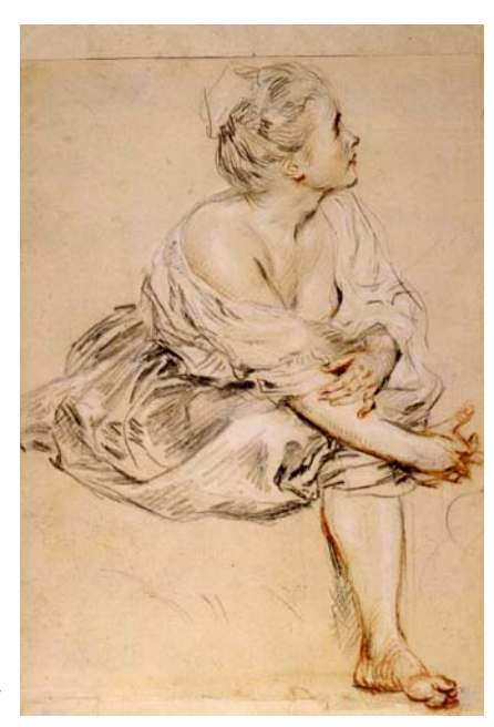
Antoine Watteau (1684–1721) Seated Young Woman, ca. 1716 Black, red, and white chalk= 10 x 6 3/4 inches (255 x 172 mm) Purchased by Pierpont Morgan, 1911; I, 278a