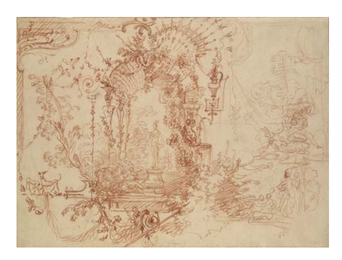
Antoine Watteau (1684–1721) Temple of Diana, 1716 Red chalk 10 1/2 x 14 1/4 inches (267 x 362 mm) Purchased on the Sunny Crawford von Bülow Fund 1978; 1980.9

October 2, 2009, through January 10, 2010