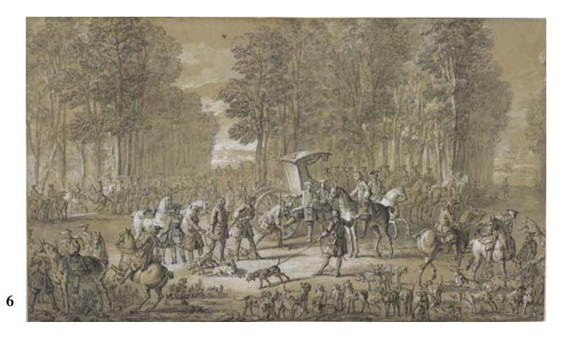
Jean-Baptiste Oudry (1686–1755)

Rally at the Carrefour du Puits du Roi, Compiègne Forest, or The Booting of the King for the Hunt, ca. 1733