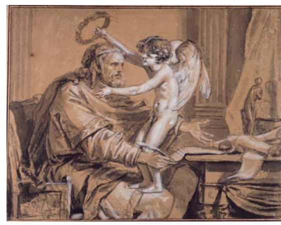
Jean-Baptiste Greuze (1725–1805) Anacreon in His Old Age Crowned by Love Pen and black ink, touches of brown ink, black wash, heightened with white tempera, over graphite, on brown paper 12 3/8 x 16 1/8 inches (314 x 407 mm) Bequest of Therese Kuhn Straus in memory of her husband, Herbert N.