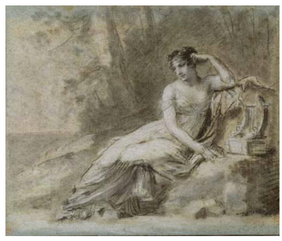
Pierre-Paul Prud'hon (1758–1823) Study for a Portrait of Empress Joséphine, 1805 Black chalk, stumped in some areas, heightened with white, on blue paper 9 3/4 x 11 7/8 inches (248 x 302 mm) Bequest of Therese Kuhn Straus in memory of her husband, Hubert N. Straus; 1977.58

12 1/4 x 19 7/8 inches (311 x 500 mm) Bequest of Miss Alice Tully; 1996.64