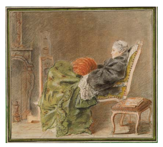
Louis Carrogis, called Carmontelle (1717–1806) Portrait of a Lady Seated by a Fire Black, red, and white chalk, watercolor, with a touch of pen and black ink 7 9/16 x 8 9/16 inches (196 x 218 mm) Purchased on the Walter C. Baker Fund; 1981.51