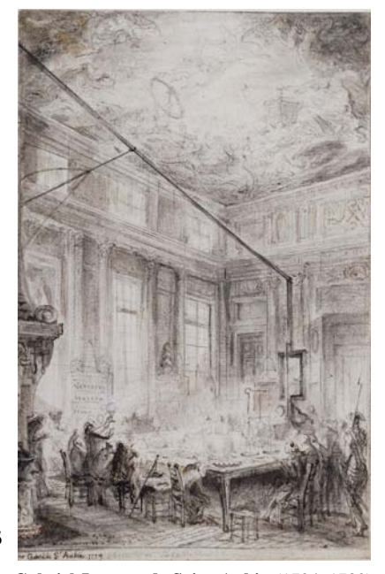
Gabriel Jacques de Saint-Aubin (1724–1780) The Lesson of the Chemist Sage at the Hôtel des Monnaies, 1779 Black chalk with some stumping and graphite, point of brush and brown ink, gray wash, some

bodycolor 7 7/8 x 5 1/16 inches (198 x 128 mm) Purchased on the Sunny Crawford von Bülow Fund 1978; 1991.4