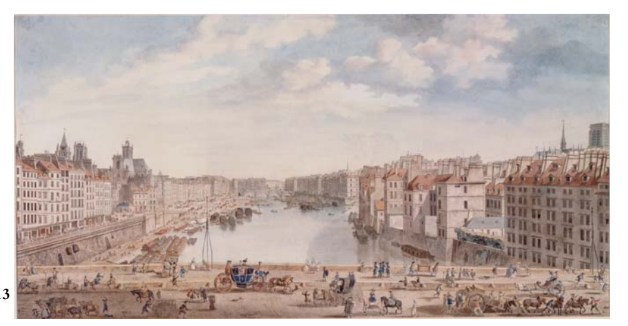
Louis Nicolas de Lespinasse (1734–1808) View of the Banks of the Seine, Paris Pen and brown ink and watercolor, heightened with white, over preliminary drawing in graphite 12 7/8 x 24 13/16 inches (326 x 630 mm) Purchased on the Lois and Walter C. Baker Fund; 1994.17