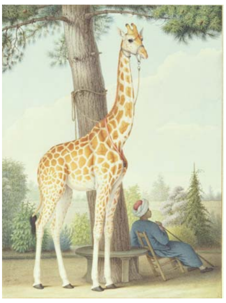
Nicolas Hüet (1770–1828) Study of the Giraffe Given to Charles X by the Viceroy of Egypt, 1827 Watercolor and some gouache, over traces of black chalk 10 1/16 x 7 5/8 inches (254 x 194 mm) Purchased on the Sunny Crawford von Bülow Fund 1978; 1994.1