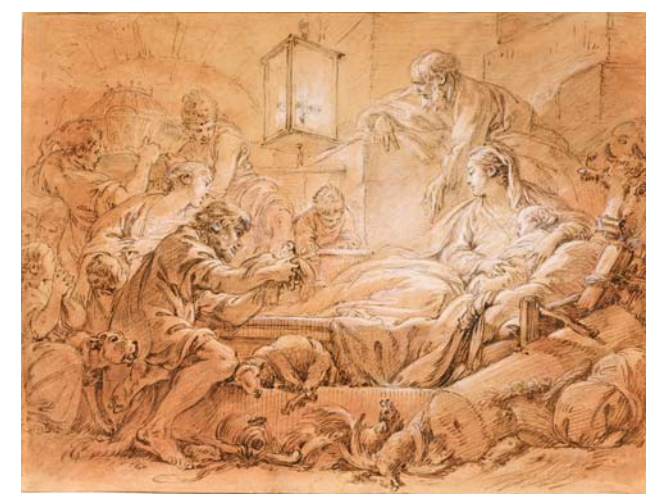
François Boucher (1703–1770) Adoration of the Sheperds, ca. 1761–62 Pen and brown ink, brown and red wash, brown and black chalk, heightened with white chalk, worked wet, over traces of black chalk, on pink-prepared paper 11 3/8 x 14 5/8 inches (289 x 371 mm) Thaw Collection, The Morgan Library & Museum