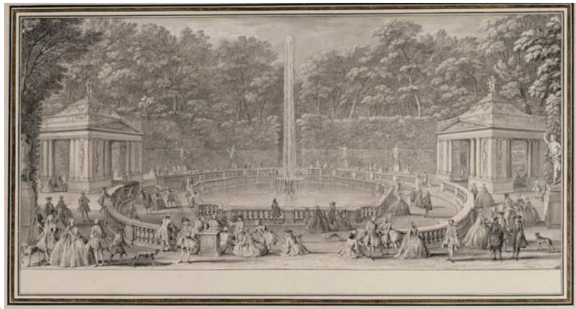
Jacques Rigaud (1681–1754) Les Dômes, 1730 Black chalk, pen and gray ink, gray wash 8 5/8 x 18 5/8 inches (220 x 473 mm) Purchased on the Lois and Walter C. Baker Fund; 2007.89