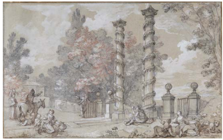
Charles Joseph Natoire (1700–1777)

A View of the Top of the Cascade at the Villa Aldobrandini, Frascati, 1762 Pen and brown ink, brown wash, black and red chalk, heightened with white on blue paper