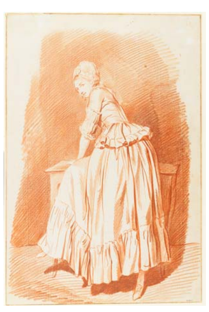
Louis-Roland Trinquesse (ca. 1745–ca. 1800) Study of a Lady of Fashion Red chalk 14 13/16 x 10 1/16 inches (376 x 254 mm) Purchased on the Sunny Crawford von Bülow Fund 1978; 1990.16

For high resolution images, please contact Sandra Ho, The Morgan Library & Museum at sho@themorgan.org or (212) 590-0311.