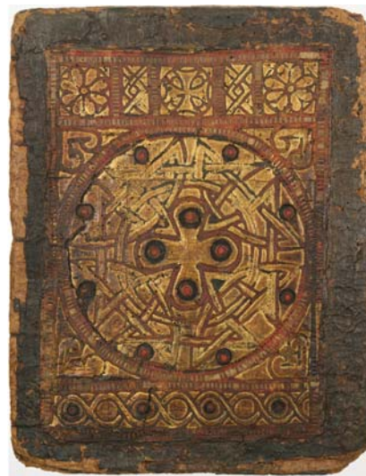
4. Coptic Tracery Binding Egypt, the Fayum, 7 th or 8 th century Cover of a Gospels, Monastery of Holy Mary Mother of God, Perkethoout, the Fayum Purchased by Pierpont Morgan, 1911 The Morgan Library & Museum; M. 569