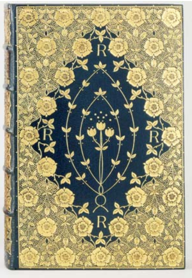
3. Dante Gabriel Rossetti, Poems Binding dated 1891 London: F. S. Ellis, 1879 Purchased by Pierpont Morgan, ca. 1902 The Morgan Library & Museum; PML 7242