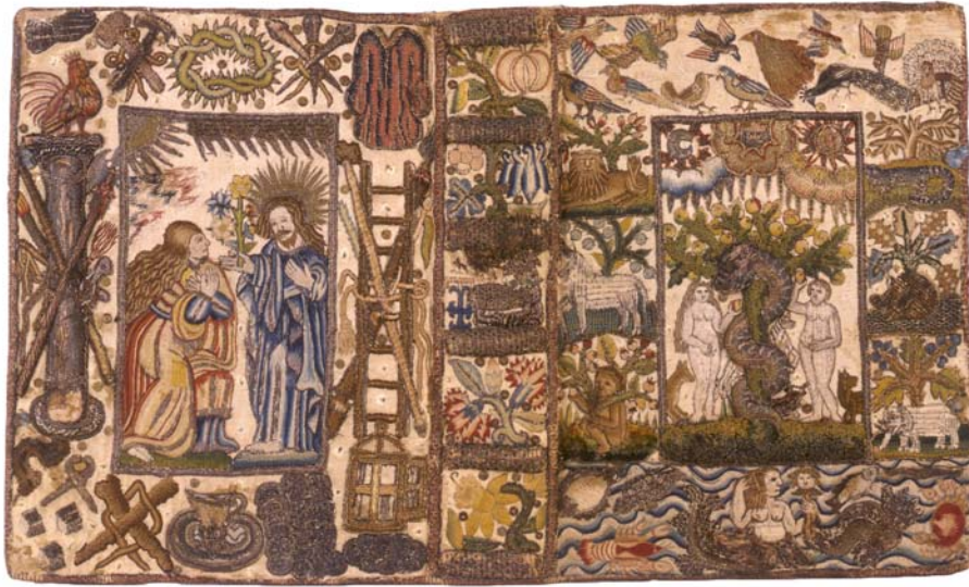
5. Embroidered Binding English, ca. 1640–50 On: The Bible London: Deputies of Christopher Barker, 1599 Purchased by Pierpont Morgan, 1910 The Morgan Library & Museum; PML 17197