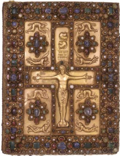
1. Jeweled upper cover of the Lindau Gospels ca. 880 Court School of Charles the Bald On: Lindau Gospels, in Latin Switzerland, Abbey of St. Gall Purchased by Pierpont Morgan, 1901 The Morgan Library & Museum; MS M. 1

December 5, 2008, through March 29, 2009