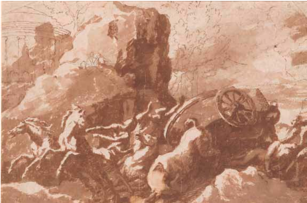
Nicolas Poussin (1594–1665), Death of Hippolytus , 1645, pen and brown ink and wash over black chalk. The Morgan Library & Museum; Purchased by Pierpont Morgan in 1909, I, 267.

Poussin, Claude, and French Drawing in the Classical Age , a new exhibition opening at the Morgan Library & Museum on June 16, explores the work of some of the most celebrated artists of the time. More than fifty drawings largely from the Morgan's collections—including works by Claude Lorrain, Nicolas Poussin, Jacques Callot, and Charles Le Brun—will be on view. Together they demonstrate the era's distinctive approach to composition and subject matter, informed by principles of rationalism, respect for the art of classical antiquity, and by a belief in a natural world governed by divine order. The exhibition runs through October 15.