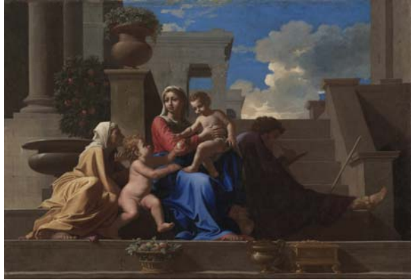
Right : Nicolas Poussin (1594–1665), The Holy Family on the Steps 1648, oil on canvas. The Cleveland Museum of Art; Leonard C. Hanna, Jr. Fund 1981.

bold and at times abstract, revealing his interest in overall effect and coherence over detail. This style would prove influential on his contemporaries in Rome, including his fellow Frenchmen Charles Mellin (1597–1649) and Gaspard Dughet (1615–1675).