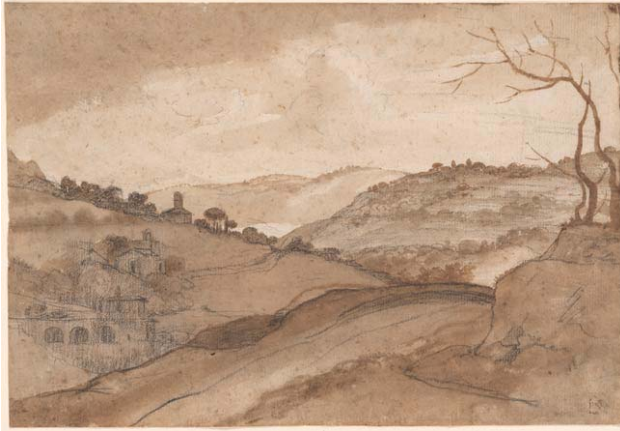
Left: Claude Gellée, called Claude Lorraine (1600–1682), A Hilly Landscape, with Bare Trees , 1639–41, brush and brown wash over black chalk. The Morgan Library & Museum; Purchased by Pierpont Morgan (1837-1913) in 1909; III, 82b.