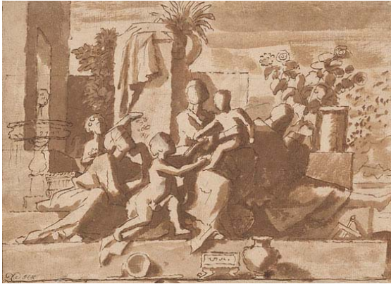
Left: Nicolas Poussin (1594–1665), The Holy Family on the Steps , pen and brown ink, brown wash, with touches of gray wash, over black chalk, on paper. The Morgan Library & Museum; Purchased by Pierpont Morgan in 1909, III,71.