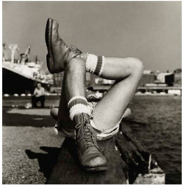
Left: Gay Liberation Front Poster Image, 1969, gelatin silver print, purchased on The Charina Endowment Fund, The Morgan Library & Museum, 2013.108:1.76. Right: Christopher Street Pier (2), 1976, gelatin silver print, purchased on The Charina Endowment Fund, The Morgan Library & Museum, 2013.108:1.84.

The Christopher Street Pier, on the Hudson River at West Tenth Street, was known familiarly in the 1970s as "the sex pier." A place to see others displayed and to display oneself, it was also a site where a photographer could work openly. The pier is an idyll in Hujar's photographs. Despite its extralegal, outsider status, it exists under broad sunlight, seamlessly a part of city life. During a heat wave on Easter weekend in 1976, Hujar photographed a man framed by his crossed legs on the pier's wooden ledge. The place and the mood are instantly recognizable in the image, which later appeared on the cover of an issue of The Village Voice celebrating gay life on the tenth anniversary of Stonewall.