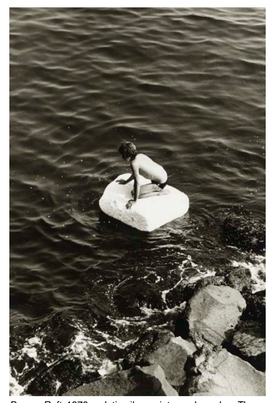
Boy on Raft, 1978, gelatin silver print, purchased on The Charina Endowment Fund, The Morgan Library & Museum, 2013.108:1.97.

New York, NY, January 9, 2018 — The life and art of Peter Hujar (1934–1987) were rooted in downtown New York. Private by nature, combative in manner, well-read, and widely connected, Hujar inhabited a