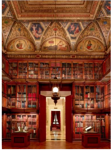
1. & 2. Mr. Morgan's Library (East Room). The Morgan Library & Museum.