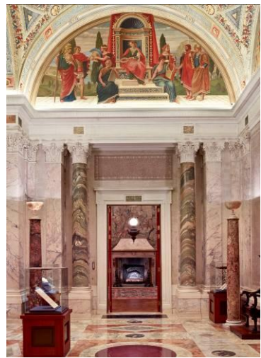
7. Rotunda facing East Room. The Morgan Library & Museum.