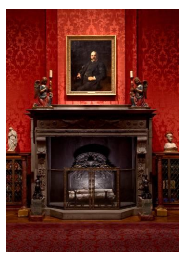
5. Vault in Mr. Morgan's Study (West Room). The Morgan Library & Museum.