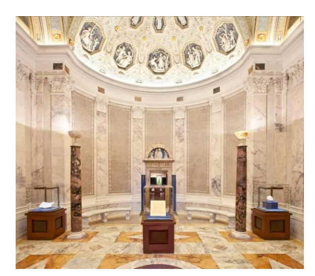
6. Rotunda facing North Room. The Morgan Library & Museum. Photography by Graham Haber, 2010.