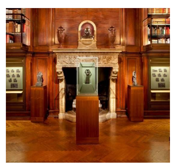
8. Librarian's Office (North Room). The Morgan Library & Museum.