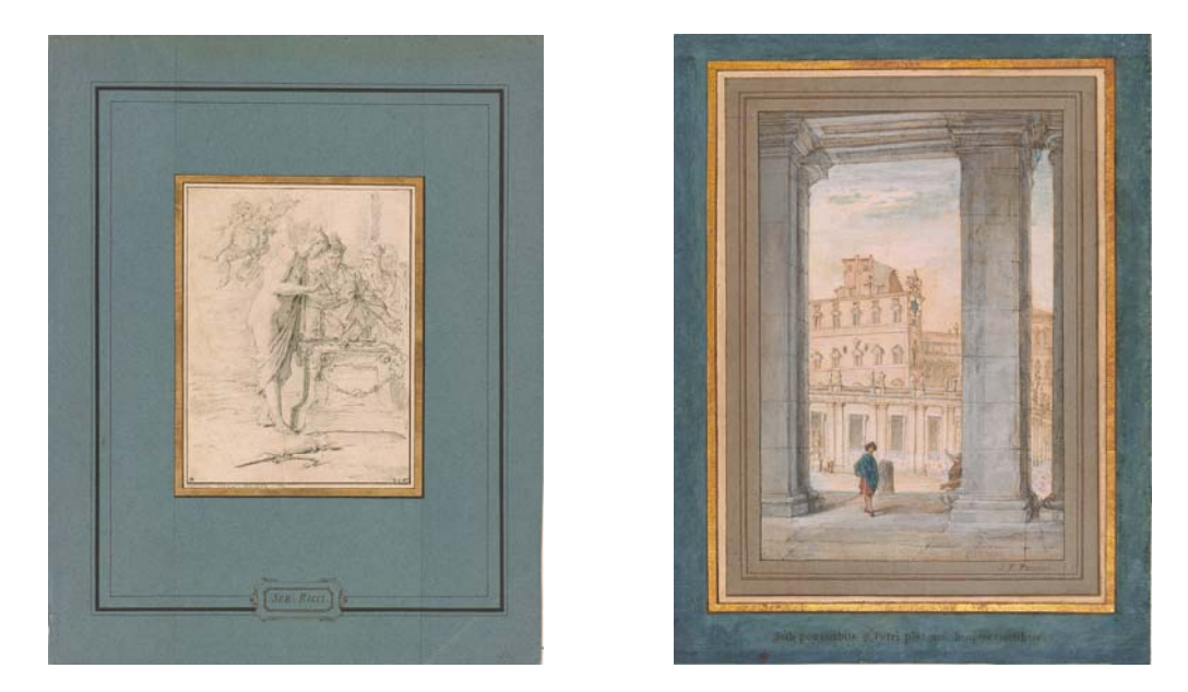
Left: Sebastiano Ricci (1659–1734), Venus and Cupid with other Figures before an Altar, ca. 1700. Black chalk. The Morgan Library & Museum. Right: Giovanni Paolo Panini (1691–1765), View of the Vatican Palace from the Colonnade of St. Peter's, ca. 1759–62. Pen and brown ink, brush and brown wash, watercolor and white gouache, over black chalk. Thaw Collection. The Morgan Library & Museum.

The heir to a well-established dynasty of printmakers, publishers, and print dealers from Paris, Mariette formed a collection that included drawings both by old masters and by contemporary artists such as the Italian painters Sebastiano Ricci (1659-1734) and Giovanni Paolo Panini (1691/92–1765). The collection was encyclopedic in scope and included masterpieces and works by little known artists. Pierre-Jean Mariette and the Art of Collecting Drawings presents a selection of some twenty drawings representative of Mariette's holdings. The works on view come primarily from the Morgan's own collections, but the exhibition also includes sheets from the Metropolitan Museum of Art, the Princeton University Art Museum, and private collections. Among the artists represented are masters such as Parmigianino (1503–1540), Annibale Carracci (1560–1609), Guercino (1591–1666), Salvator Rosa (1615–1673), and Sébastien Bourdon (1616–1671).