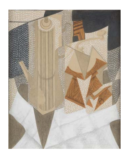
9. Juan Gris (1887–1927) Coffee Grinder, 1916 Gouache and graphite pencil 18 ½ x 11 5/8 inches (45.7 x 27.9 cm) Kasper Collection