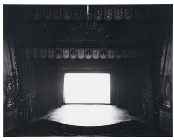
13. Hiroshi Sugimoto (b. 1948) Beacon Theatre, New York, 1979 Gelatin silver print 16 1/2 x 21 1/4 inches (41.9 x 54 cm) Kasper Collection © Hiroshi Sugimoto Courtesy The Pace Gallery