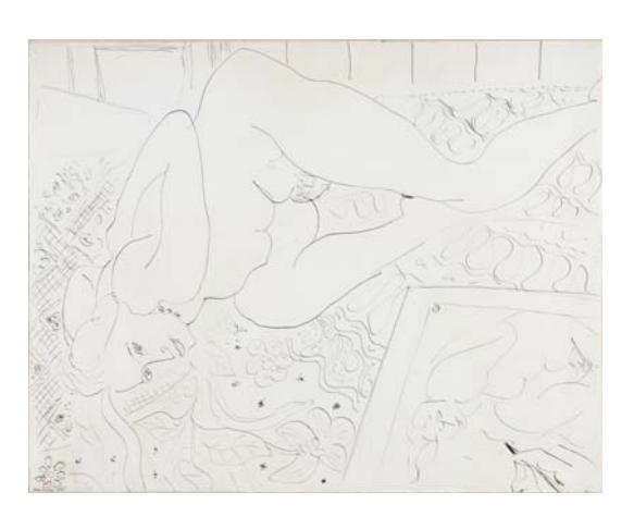
10. Henri Matisse (1869–1954) Large Nude, 1935 Pen and black ink 17 3/4 x 22 1/4 inches (45.1 x 56.5 cm) Kasper Collection © 2010 Succession H. Matisse / Artists Rights Society (ARS), New York