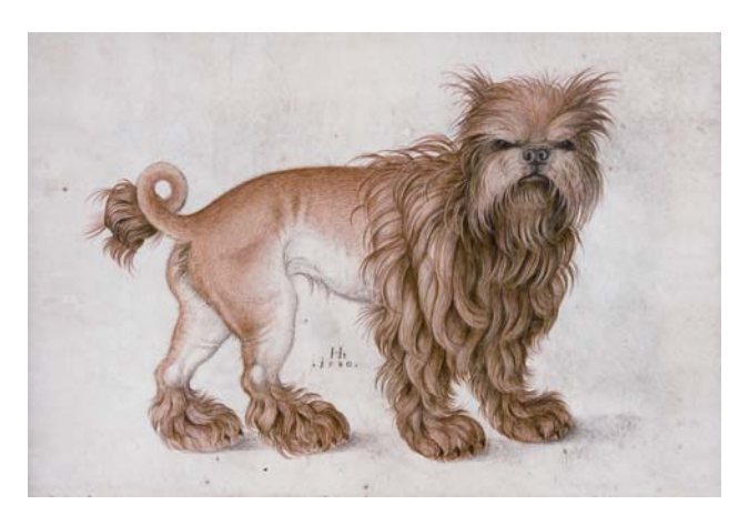
5. Hans Hoffmann (1540/50–1591/92) An Affenpinscher, 1580 Watercolor and gouache on vellum 10 x 14 1/4 inches (25.5 x 36 cm) Kasper Collection