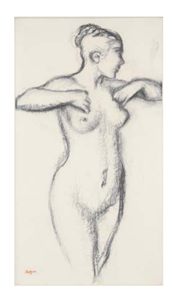
7. Edgar Degas (1834–1917) Study for a Dancer Adjusting Her Bodice, ca. 1897 Charcoal 18 1/2 x 10 1/4 inches (47 x 26 cm) Kasper Collection, Promised gift to The Morgan Library & Museum