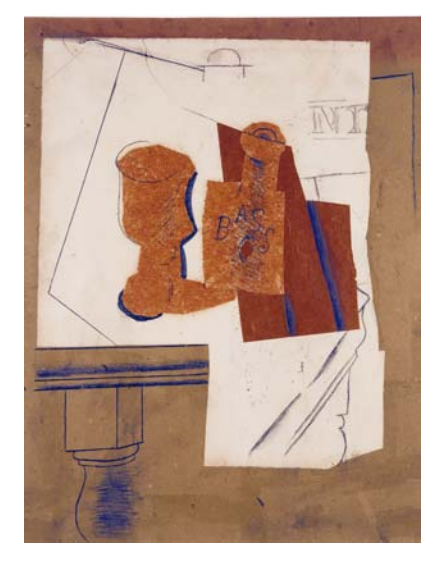
8 Pablo Picasso (1881–1973) Glass and Bass Bottle on a Table, 1913 Collage, wash, sawdust, and graphite pencil on cardboard 23 1/2 x 17 1/2 inches (59.7 x 44.4 cm) Kasper Collection © 2010 Estate of Pablo Picasso / Artists Rights Society (ARS), New York