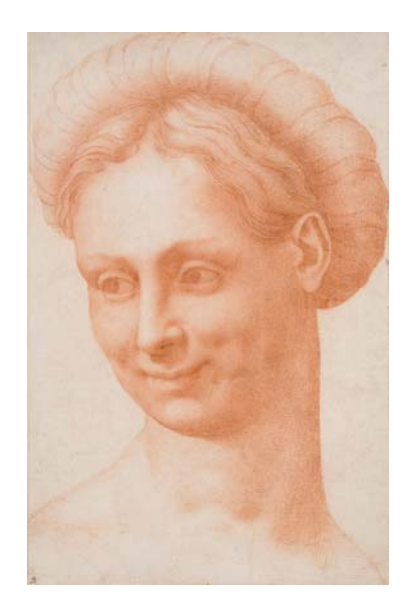
1. Baccio Bandinelli (1493–1560) Head of a Woman Wearing a Ghirlanda Red chalk 11 1/4 x 7 1/8 inches (28.6 x 18.1 cm) Kasper Collection