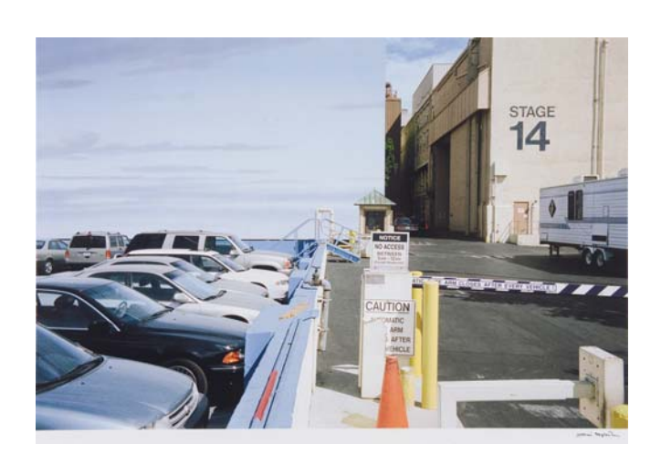
14. William Eggleston (b. 1939) Stage 14, Parking Lot, Hollywood, 1999–2000 Iris print 24 x 30 inches (61 x 76.2 cm) Kasper Collection © Eggleston Artistic Trust Courtesy Cheim & Read, New York