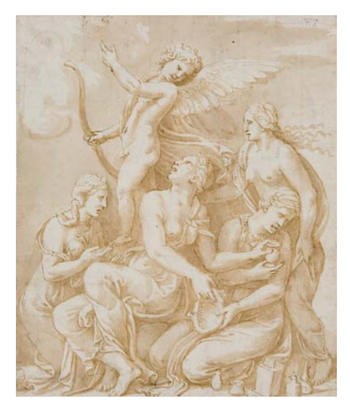
2. Giulio Romano (Giulio Pippi) (ca. 1499–1546) Cupid and Psyche and Other Figures, 1524–40 Pen and brown ink, brown wash 8 1/2 x 7 1/8 inches (21.6 x 18.1 cm) Kasper Collection