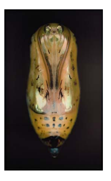
15. Adam Fuss (b. 1961) Untitled, 2003 Pigment print 72 x 44 inches (182.9 x 111.8 cm) Kasper Collection

For high resolution images, please contact Sandra Ho, The Morgan Library & Museum at sho@themorgan.org or (212) 590-0311.