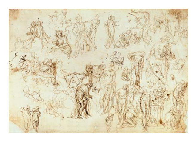
4. Paolo Veronese (1528–1588) Sheet of studies for The Consecration of David and for figures and architecture at Villa Barbaro, Maser, ca. 1558–62 Pen and brown ink. Laid down. 8 7/16 x 12 1/4 inches (21.4 x 31.1 cm) Kasper Collection