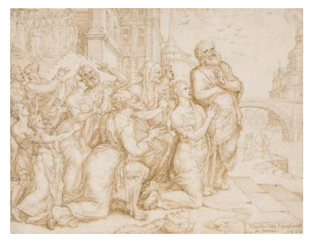
3. Maarten van Heemskerck (1498–1574) Susama and Her Relatives Praising the Lord (Daniel 13:63), 1562 Pen and brown ink over black chalk with some of the outlines incised; later addition of framing lines in brown ink 7 5/8 x 9 7/8 inches (19.3 x 25 cm) Kasper Collection