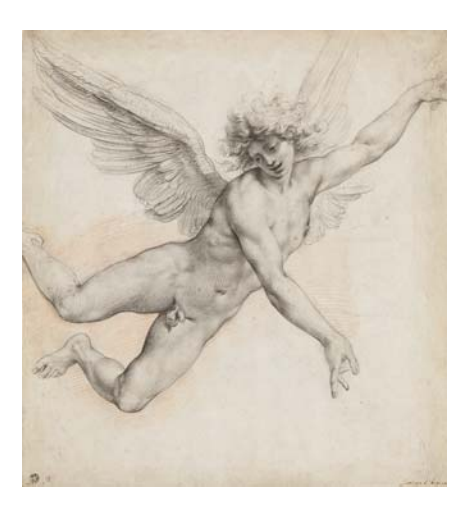
6. Giuseppe Cesari (il Cavaliere d'Arpino) (1568–1640) An Angel in Flight, ca. 1596–1599 Black and red chalk 15 3/8 x 14 1/4 inches (39.1 x 36.2 cm) Kasper Collection