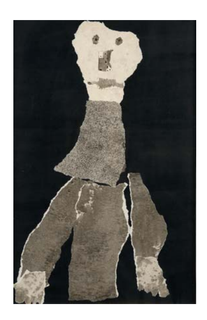
11. Jean Dubuffet (1901–1985) Clainvoyant Beard (Barbe de Voyance), 1959 Paper collage and black ink 20 x 13 3/8 inches (51 x 34 cm) Kasper Collection, Promised gift to The Morgan Library & Museum © 2010 Artists Rights Society (ARS), New York / ADAGP, Paris