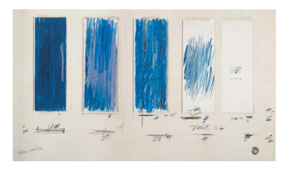
Cy Twombly. Untitled (1970). The Menil Collection, Houston, Gift of the artist. © Cy Twombly Foundation.