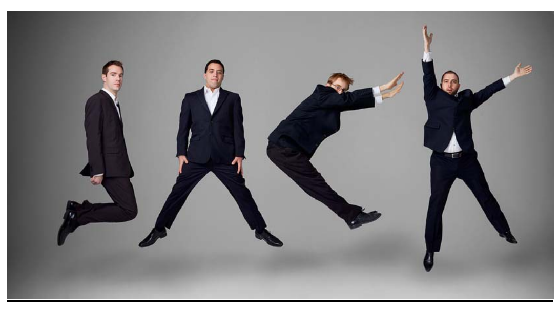
The JACK Quartet.

New York, NY, November 7, 2014 — To coincide with the exhibition Cy Twombly: Treatise on the Veil , the Morgan Library & Museum presents a concert by the dynamic JACK Quartet on Thursday, November 20, 7 PM and 9 PM, showcasing a selection of compositions from Matthias Pintscher's Studies for Treatise on the Veil (2004–2009). Pintscher's scores were written in response to Twombly's painting, and the JACK's performance at the Morgan offers a special, one-time-only opportunity to bring the painting and the music together in the exhibition gallery. New arrangements of Monteverdi's L'Orfeo for string quartet will also be performed by the JACK.