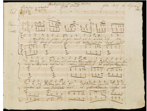
Franz Schubert (1797–1828), Winterreise , D. 911, autograph manuscript of the song cycle (1827), The Pierpont Morgan Library, The Mary Flagler Cary Music Collection; Cary 215.

The department of Music Manuscripts and Books houses one of the finest collections of music manuscripts in the country and also owns a large collection of musicians' letters and a small but growing collection of first and early editions of scores and librettos. The Morgan has the world's largest collection of Mahler manuscripts and substantial holdings of Brahms, Chopin, Debussy, Mozart, Schubert, and Richard Strauss. The collection spans six centuries and many countries. The Morgan's holdings of materials relating to the lives and works of the dramatist William S. Gilbert and the composer Arthur S. Sullivan is the most extensive archive of its kind in the world.