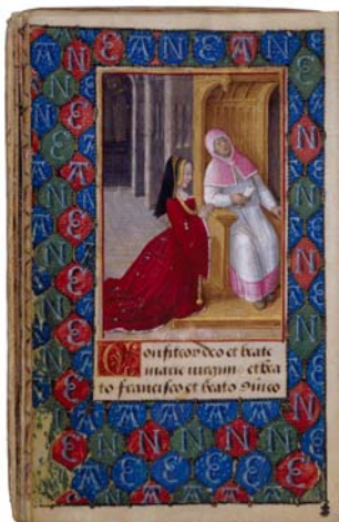
Prayer Book of Anne de Bretagne, in Latin and French (detail), 1492–95, illuminated by Jean Poyer for Queen Anne de Bretagne, The Pierpont Morgan Library, purchased by Pierpont Morgan 1905; MSM 50, fol. 10v–11r

The medieval and Renaissance manuscripts in the exhibition have been chosen to represent the range and depth of the Morgan's collection. Although Pierpont Morgan acquired medieval and Renaissance manuscripts only during the last dozen years of his life, his collection of some six hundred codices quickly became world renowned. His son, J. P. Morgan, Jr., added two hundred more manuscripts whose quality and importance matched those acquired by his father. The collection, which continues to grow, currently numbers nearly fourteen hundred books and leaves.