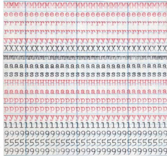
Kay Sage, Holiday card to Eleanor Howland Bunce , 1958 © 2014 Estate of Kay Sage / Artists Rights Society (ARS), New York

Many of the cards in the exhibition are playful greetings between friends in the art world. Claes Oldenburg's holiday sketch to art curator Samuel Wagstaff, dated ca. 1965, features a prominent pig spouting some kind of gibberish, perhaps Oldenburg's take on pig Latin.