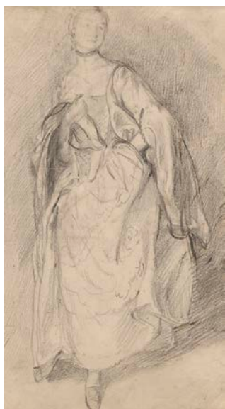
Top: A Boy with a Book and a Spade, 1748, The Morgan Library & Museum, III 59b. Bottom: Study of a Woman Holding a Shawl, 1765–70, The Morgan Library & Museum, III 57.

Thomas Gainsborough trained in London, where he displayed an innate talent for drawing and painting. The artist's earliest figure drawing, A Boy with a Book and a Spade (1748), served as a study for the signboard of a village school. Minor commissions such as this were a primary source of income for a novice painter like Gainsborough as he tried to establish his career.