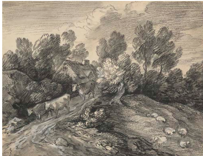
Top: Landscape with Horse and Cart, and Ruin , ca. 1770, The Morgan Library & Museum, III 55. Photography by Steven H. Crossot, 2014. Bottom: Hilly Landscape with Cows on the Road , ca. 1780, The Morgan Library & Museum, III 62. Photography by Steven H. Crossot, 2014.

Gainsborough also embraced printmaking. By combining different etching techniques, he produced prints in imitation of his drawings, replicating on the surface of the copper plate the same variety of textural and tonal effects that characterize his chalk drawings. He turned to