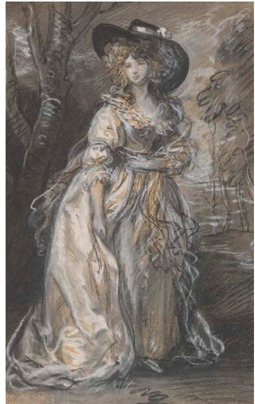
Lady Walking in a Garden, ca. 1785, The Morgan Library & Museum, III, 63b.

Beginning May 11, the Morgan Library & Museum presents an exhibition solely focused on Gainsborough’s works on paper, bringing together twenty-two outstanding examples in graphite, chalk, oil paint, and other media. Included in the show, which runs through August 19, are preparatory studies, finished works, and exercises made for the artist’s own enjoyment.