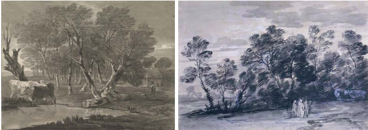
Left: Wooded Landscape with Cows beside a Pool, Figures and Cottage , 1755-1780, The Metropolitan Museum of Art, Harris Brisbane Dick Fund, 1937. Right: Figures in a Wooded Landscape , 1785–88, black chalk and gray wash, heightened with white, private collection.

aquatint to evoke the transparency of the sky and water, as seen in Wooded Landscape with Cows beside a Pool (1755-1780), a rare print from the collection of the Metropolitan Museum of Art. Toward the end of his career, he began favoring concepts rather than depicting a realistic view. In Figures in a Wooded Landscape , (1785–88), trees, animals and rocks lose their shape, and parts of the landscape veer toward pure abstraction.