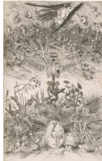
Left: Charles Baudelaire (French, 1821–1867), Édouard Manet (French, 1832–1883), Les fleurs du mal , Portrait, Paris: Poulet-Malassis et de Broise, 1857. The Morgan Library & Museum. Right: Félicien Rops, artist (Belgian, 1833–1898), Charles Baudelaire (French, 1821–1867), Les épaves , Amsterdam [i.e., Brussels: Poulet-Malassis], 1866. The Morgan Library & Museum.

all-encompassing aspirations of the Symbolist aesthetic. The movement would have a profound effect on avant-garde literature, artists' books, and modern theories of art."