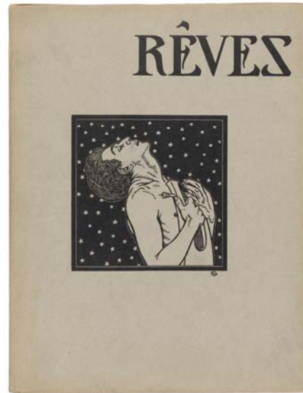
Left: Félix Vallotton (Swiss, 1865–1925), Portrait of Paul Verlaine, 1891, In L'Art et l'Idée (Paris: Quantin, 1892). The Morgan Library & Museum. Right: Carlos Schwabe, artist (Swiss, 1866–1926), Olive Schreiner (South African, 1855–1920), Rêves , Paris: Flammarion, 1912. The Morgan Library & Museum.

melancholy imagery for Maurice Maeterlinck's Serres chaudes , Redon's haunting frontispieces for the poet Iwan Gilkin, and Maurice Denis's evocative designs for André Gide's Le voyage d'Urien .