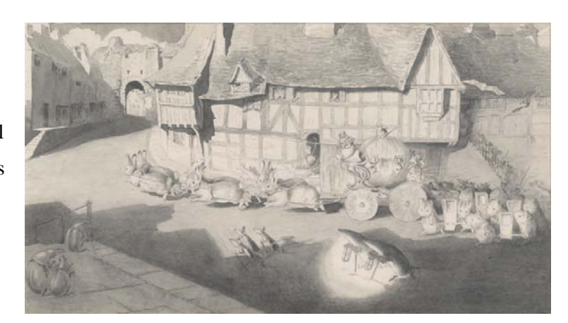
Beatrix Potter (1866–1943) Cinderella's Coach with Rabbits . 1899 Private Collection