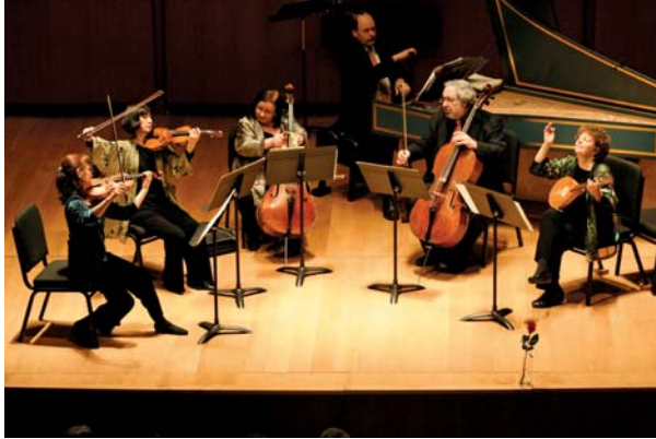
St. Luke's Chamber Ensemble.