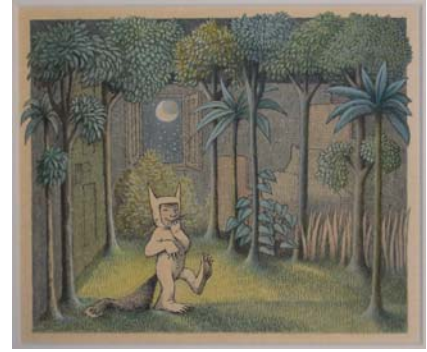
“That very night in Max’s room a forest grew / and grew.” Final drawing for Where the Wild Things Are . Pen and ink, watercolor. © Maurice Sendak, 1963. All rights reserved.

The exhibition includes such iconic images as Max in his wolf suit, grinning in his tree-filled bedroom; his arrival in the land of “wild things”; and his triumphant departure by sailboat. Also on view are a pencil drawing for the cover illustration of a sleeping “wild thing” as well as a preliminary sketch—not incorporated into the final published version—of a mischievous Max on all fours atop the dinner table slurping a strand of spaghetti.