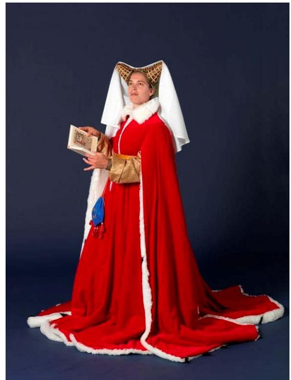
Recreation of the Houpeland of Catherine of Cleves, duchess of Guelders. Museum Het Valkhof. Re-creation designed and made by Corinne Roes of Atelier Mette Maelwael, The Netherlands.