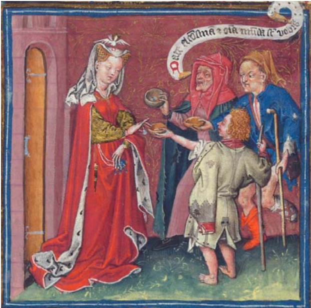
Catherine of Cleves Distributing Alms , by the Master of Catherine of Cleves. Hours of Catherine of Cleves; The Netherlands, Utrecht, ca. 1440. Pierpont Morgan Library, MS M.917, p. 65 (detail). From section 5: “Peacocks of the Mid-Century, 1430-60”