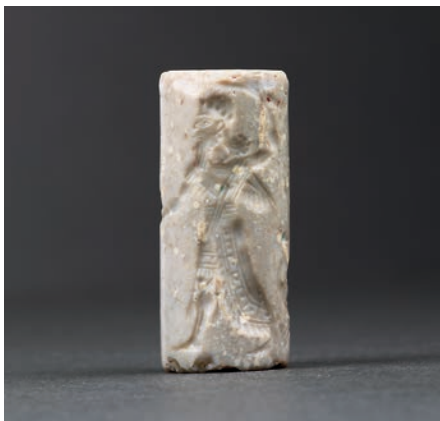
Cylinder seal depicting winged hero pursuing two ostriches, Mesopotamia, Middle Assyrian period (ca. 1250–1150 B.C.), marble, seal no. 606