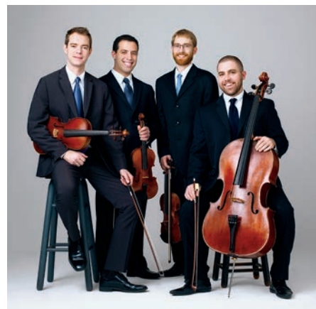
RIGHT: JACK Quartet.