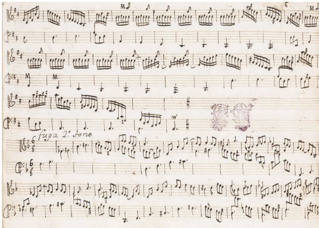
Domenico Scarlatti (1685–1757), Fuga K. 30, 1756 (?), The Morgan Library & Museum; Mary Flagler Cary Music Collection, 2011

John F. Fleming Fund The Fund for the Morgan Horace W. Goldsmith Foundation Fund Horace W. Goldsmith Foundation Fund for Americana Alex Gordon Fund for Exhibitions Belle da Costa Greene Fund Lathrop Colgate Harper Fund Exclusive of Incunabula Lathrop Colgate Harper Fund for Incunabula William Randolph Hearst Fund for Educational Programs William Randolph Hearst Fund for Scholarly Research and Exhibitions Dannie and Hettie Heineman Purchase Fund James H. Heineman Purchase Fund The Lore and Rudolf J. Heinemann Fund Drue Heinz Book Conservator Fund Drue Heinz Curator of Literary Manuscripts Fund Drue Heinz Twentieth-Century Literature Fund Edwin H. Herzog Drawings Fund The Jamie and Maisie Houghton Endowment Fund William W. Karatz and Joan G. Smith Acquisitions Endowment Fund