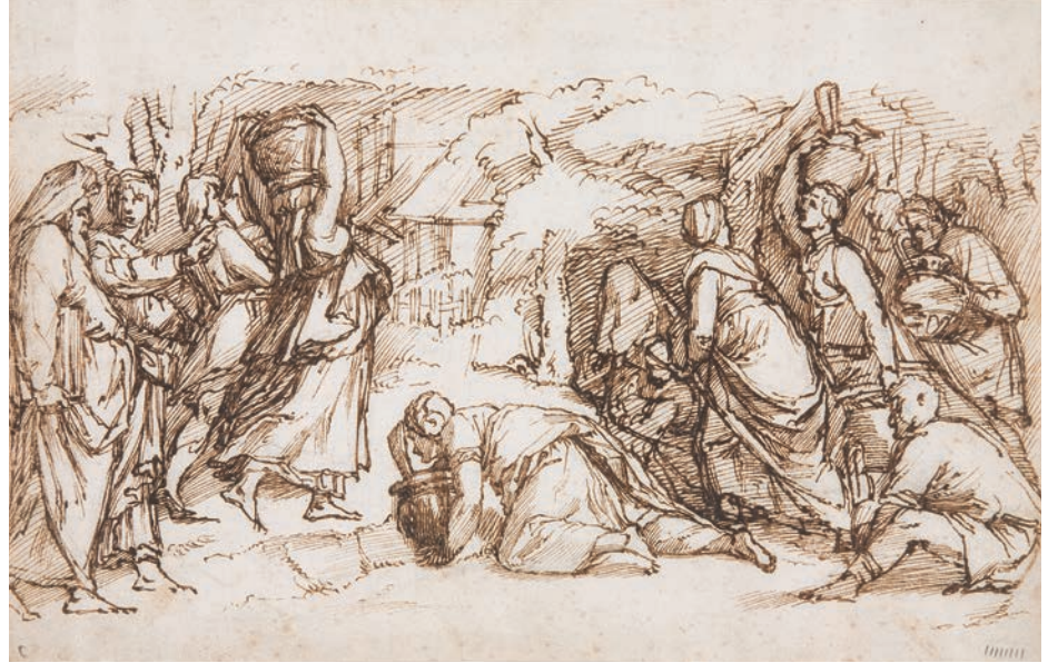
Giovanni Battista Naldini (1537–1591), The Israelites Fleeing Egypt , ca. 1560–1, gift of The Kasper Collection, The Morgan Library & Museum.

Gift of Marianne Elrick-Manley and Amy Wolf Amy Cutler (b. 1974), Four Little Pigs , 2000