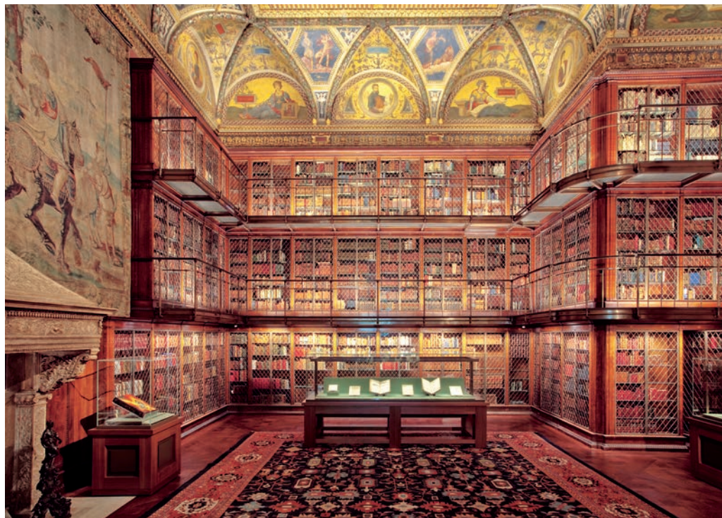
Pierpont Morgan's 1906 Library.