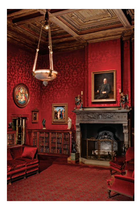
Pierpont Morgan's Study (The West Room). Photography by Graham Haber, 2010.