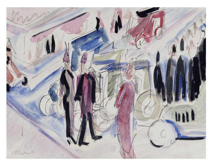
Ernst Ludwig Kirchner, Figures on a Busy Street (detail), 1914. Bequest of Fred Ebb; 2005.140.

Mary Flagler Cary Acquisitions Fund for Music