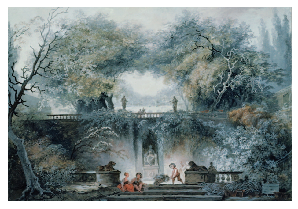
Jean-Honoré Fragonard (1732–1806), Interior of a Park: The Gardens of Villa d'Este, gouache on vellum. Thaw Collection, The Morgan Library & Museum; 1997.85.

Gift of the Al Held Foundation, Inc. Al Held (1928–2005), 66 6-A, 1966