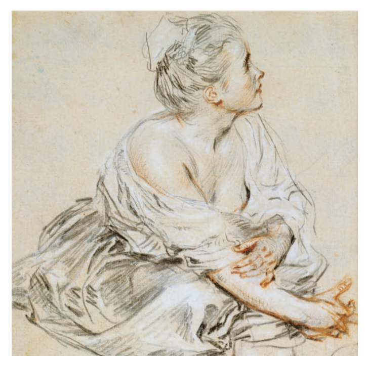
Antoine Watteau, Seated Young Woman (detail), ca. 1716, black, red, and white chalk. Purchased by Pierpont Morgan, 1911; 1, 278A.