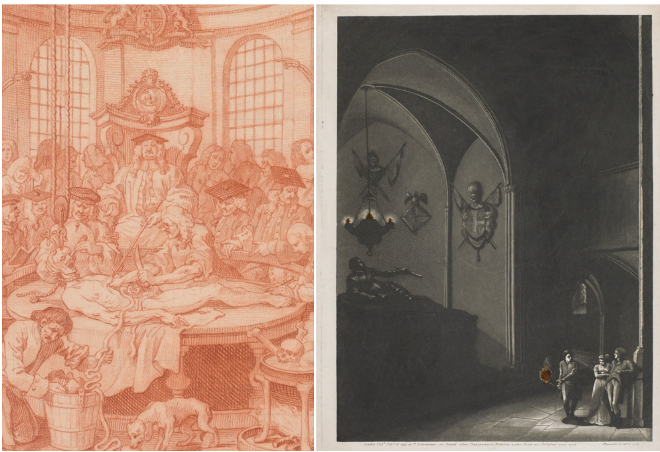
LEFT: William Hogarth (1697–1764), The Reward of Cruelty , ca. 1751, red chalk with smudging, squared in graphite, on laid paper, incised with stylus; verso rubbed with red chalk for transfer. The Morgan Library & Museum, purchased by Pierpont Morgan in 1909, III, 32e. RIGHT: Franz Joseph Manskirch (1768–1830), Interior of a Gothic Crypt , aquatint with etching and some hand coloring and varnish on paper, London: Rudolph Ackermann, 1799. The Lewis Walpole Library, Yale University.

"compact made before her creation," and he destroys the female creature before she is complete (170). The Creature is overcome with anger and vows, "I shall be with you on your wedding-night" (173).